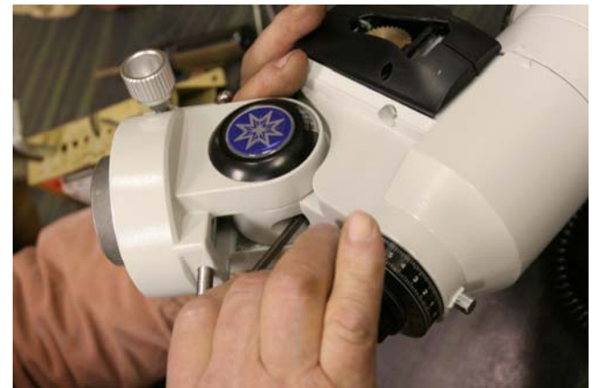
Remove the hex screw between the latitude adjusting screw and the polar scope.