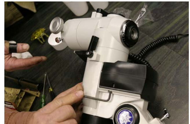
With the LXD75 in the counterweight down position (No counterweights, bar or scope) remove the 2 hex head screws on each side of the plastic housing.

After the completion of the February 23<sup>rd</sup> Work Party a few members gathered around to found out why a member's Meade LXD75 German Equatorial Mount (GEM) had excessive backlash in the right ascension axis. Mike Matti and John Blomquist disassembled the mount to fix the problem. This is a photo record, with a few descriptions, of that process.