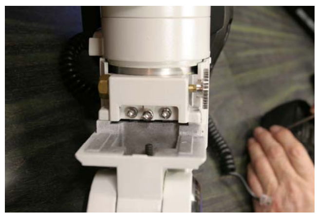
Check for end play on the shaft and make sure that the gear setscrew is tight and is positioned on the flat part of the shaft. The 3 hex screws that you see here are the worm adjusting screws.