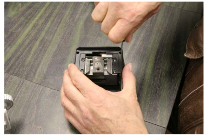
Using a small Phillips screwdriver remove the 4 screws that hold the housing in place.