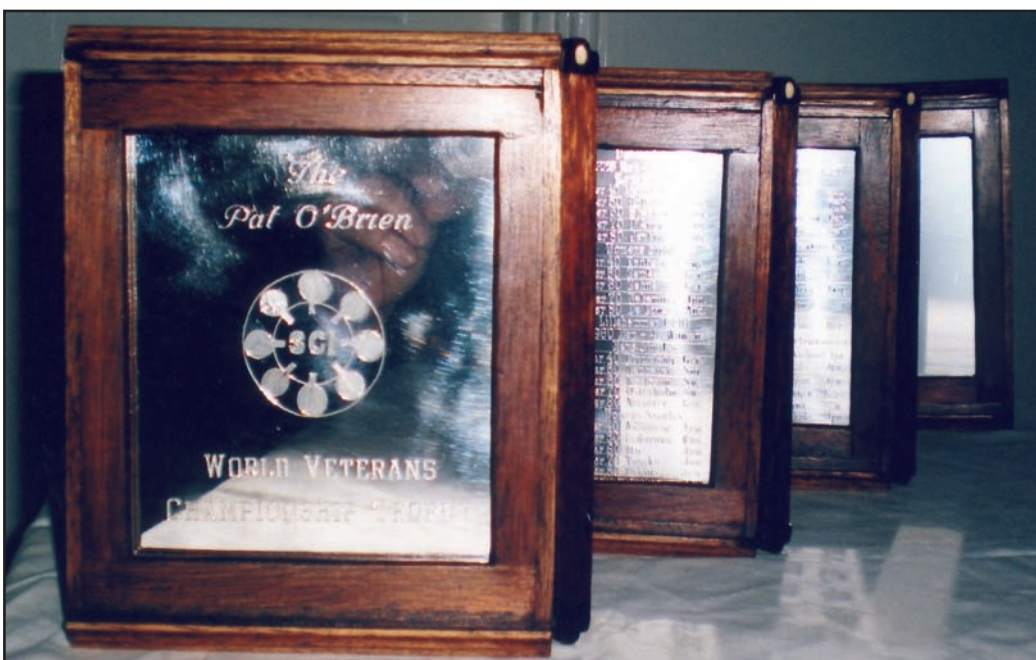
◀ The Pat O'Brien Winners Trophy