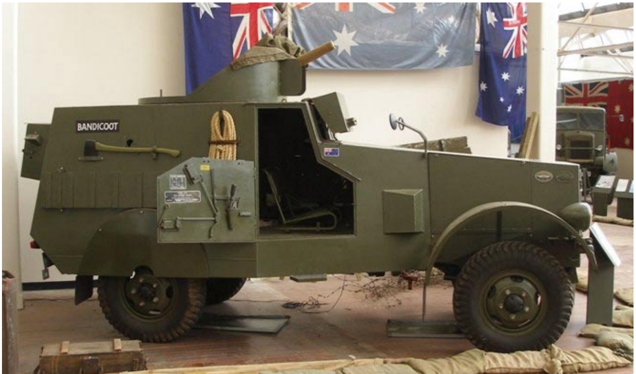
Ley Reynolds - http://www.warwheels.net/LocalPattern4AussieREYNOLDS.html