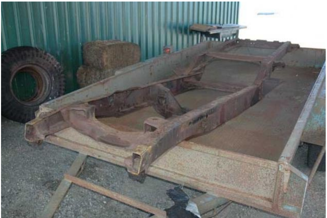
Australian Dingo Scout Car chassis – John Belfield Collection (Australia) Chassis number 2C 14482F (OLDCMP.net)

http://www.imagecontrol.com.au/oldcmp/Dingo_1.html#Anchor-49575