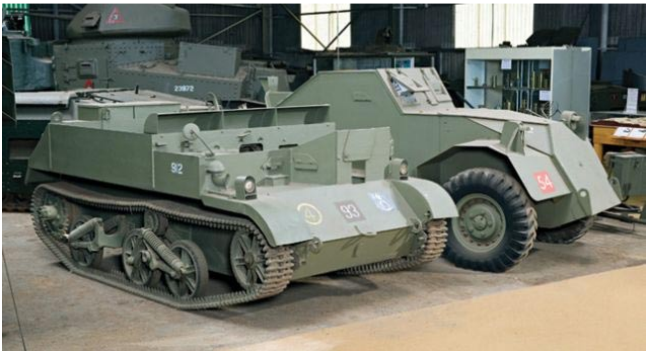
Australian Dingo Scout Car – Australian Armour and Artillery Museum Cairns, QLD (Australia) Formerly part of Rick Cove Collection (Australia)

Bonhams & Goodman, 2006 - http://www.bonhamsandgoodman.com.au/lot_details.php?lot=9381&auction=21#