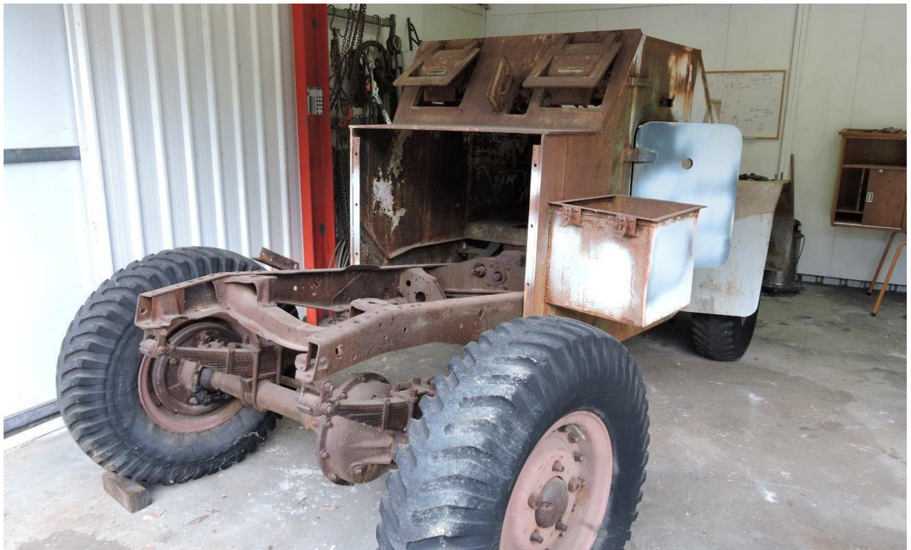
Australian Dingo Scout Car – Nungarin Heritage Machinery and Army Museum, Nungarin, Western Australia (Australia)

"grahcom", October 2007 - http://picasaweb.google.com/grahcom/2007SouthWestWATrip4#5130778541014717554