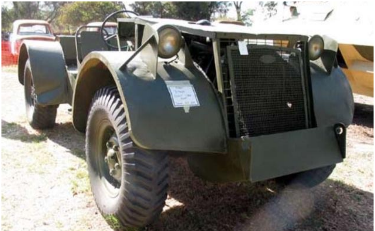
Australian Dingo Scout Car – Southern Cross Militaria Pty Ltd, Toowoomba, QLD (Austr.)