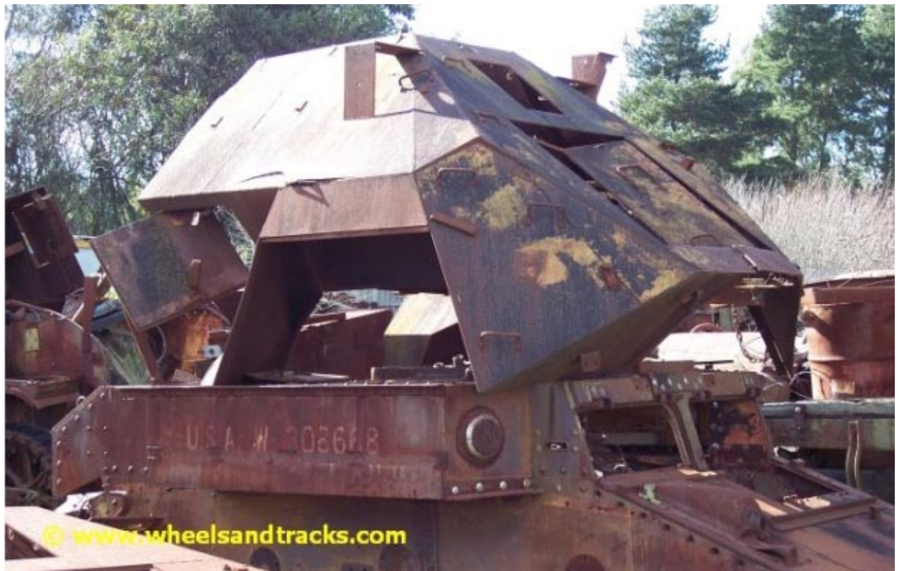
Some Rover Light Armoured Car armour parts Nungarin Heritage Machinery & Army Museum, Nungarin, WA (Australia)