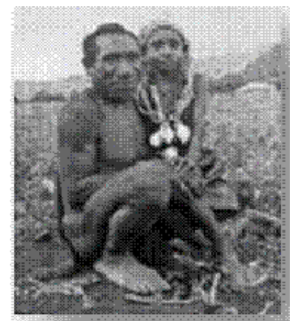
Figure 5. Foreinitiate1961. Accompanied by his father he visits relatives to exhibit his new status.

Most significantly, not all Fore were cannibals. Cannibalism among adult men in the North Fore occurred more frequently than it did in the south; in the south, men rarely ate human flesh, and those who did said they avoided eating the bodies of women. Small children residing in houses with their mothers ate what their mothers gave them. Initiated youths who moved to the communal men's house approximately at age 10 left behind the world of immaturity, femininity and cannibalism. Consumption of human flesh was thus largely limited to adult women, children of the sexes and a few adult men, a pattern that matched the epidemiology of kuru in the early 1960<sup>17</sup>.