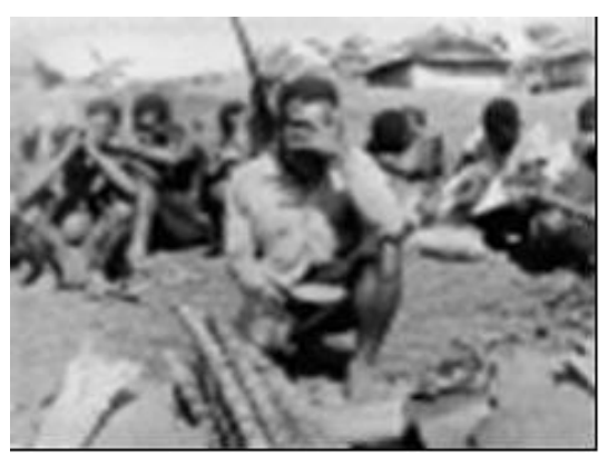
Figure 3. Bride price presentation, 1962. Men pray that the bride will survive and produce children.

Faced with a demographic emergency, the dimensions of which they grasped clearly, the South Fore had recourse to a series of desperate remedies During 1961 and 1962 the Fore expended much time, material wealth and emotional energy in an attempt to locate the sorcerers they believed to be responsible for the calamity. They also consulted a variety of curers in distant locations, taking ambulant victims of the disease on healing pilgrimages, the most spectacular of which took place among the neighbouring Gimi people. Between April and August 1961, more than 70 patients consulted a Gimi curer whose therapy consisted of bloodletting, the ingestion of medicinal barks and leaves, and the identification of the location where the guilty sorcerer might be found. Back at home, the sick women sometimes revealed the identity of their aggressor, said to have come to them in a dream. With the women present, men also conducted divination tests to reveal the sorcerers' identities, which often led to new tensions when the tests suggested that the sorcerers might be close neighbours and relatives. To the often expressed fear of extinction from the loss of women's reproductive power was now added a fear of internal disruption so great that their future was in danger.