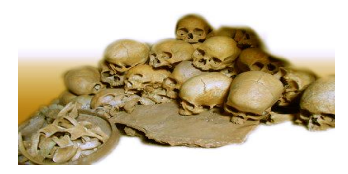
Figure 4: Brain eating phenomenon in kuru

The threat of banishment derived its force from the colonial regime's access to armed police, and the ability to jail those who disobeyed the new laws. Government patrols, though infrequent, caused a ripple of anxiety as the official party, including the police, camped for several days in selected communities, where they carried out a census, identified people with leprosy to be sent for treatment at a distant government hospital and adjudicated disputes that local groups had been unable to resolve.