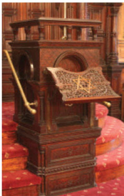
The cantor's stand at the Eldridge Street Synagogue had a ledge, with saw-tooth hinges, that adjusted according to the cantor's height.