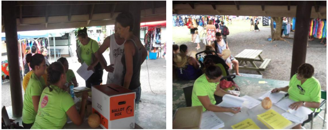
youth population to register in this election.

The Electoral Office set out to engage a team of volunteers to specifically target the