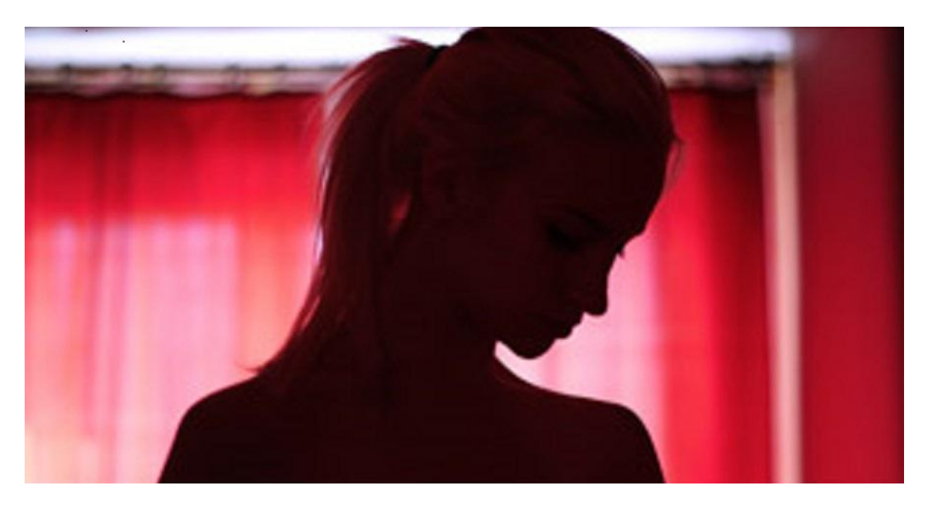
(This picture does not represent any of the mentioned parties in the following report)