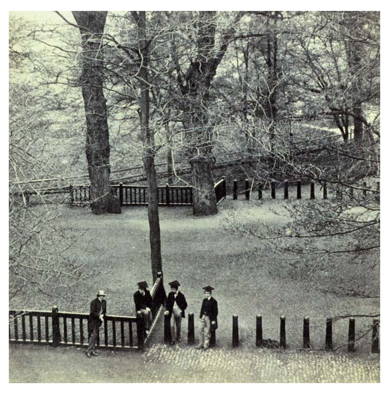
The Broad Walk, Oxford, June 1857. IN 213 (Princeton). This view of the Broad Walk at Christ Church with four undergraduates in the foreground was taken from a window in rooms occupied by Reginald Southey.

Fenton and Brady, just like Dodgson, could not photograph movement , as exposure times needed to be too long, even if only one or two seconds in bright sunshine, thus reducing any moving object to a blur on the plate.