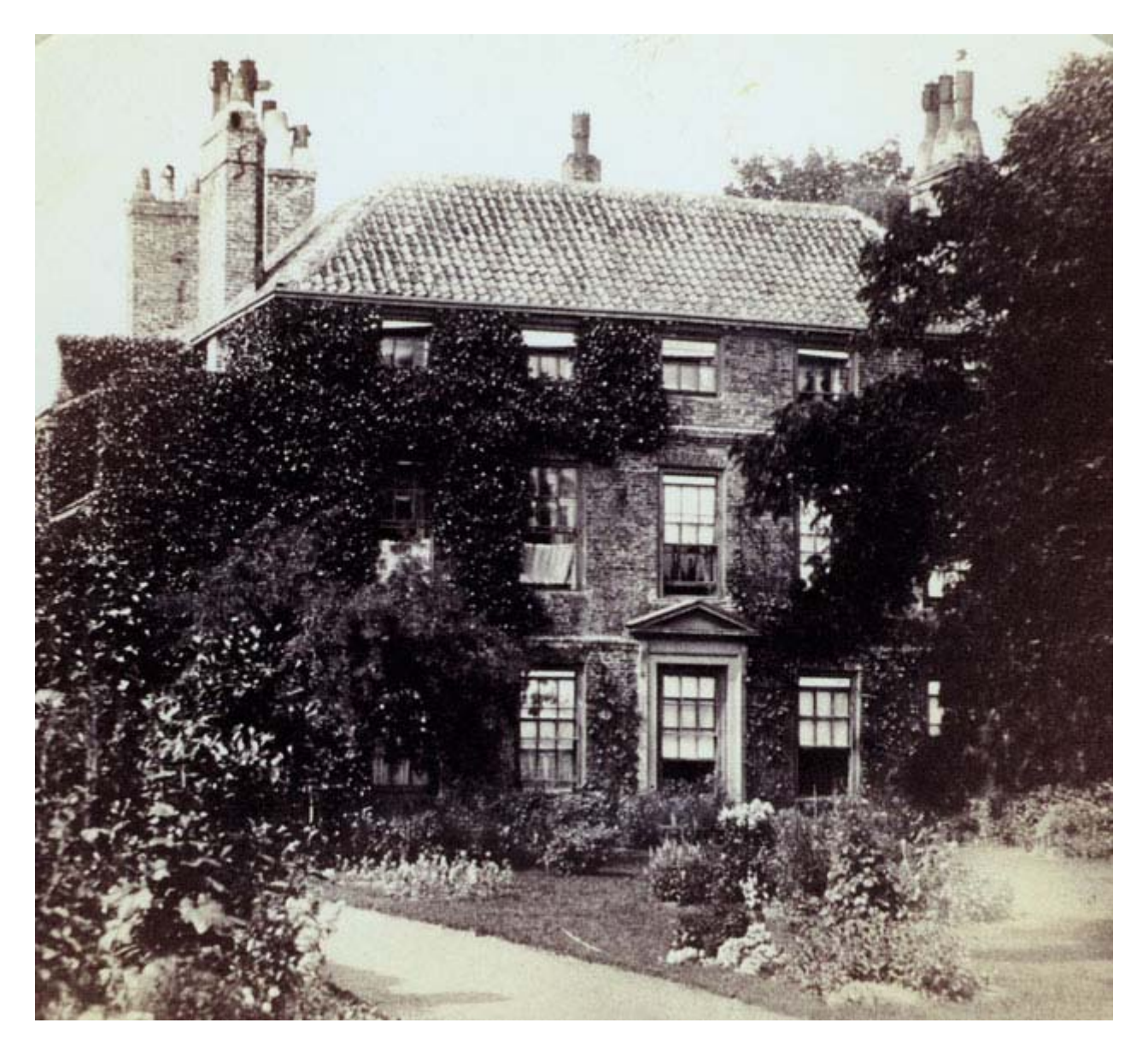
Croft Rectory, July 1856. IN 64 (Princeton). Croft Rectory, at Croft-on-Tees, Yorkshire, was the Dodgson family home from 1843 until 1868. This photograph was taken during Dodgson's return to the Rectrory for the summer holiday in 1856.