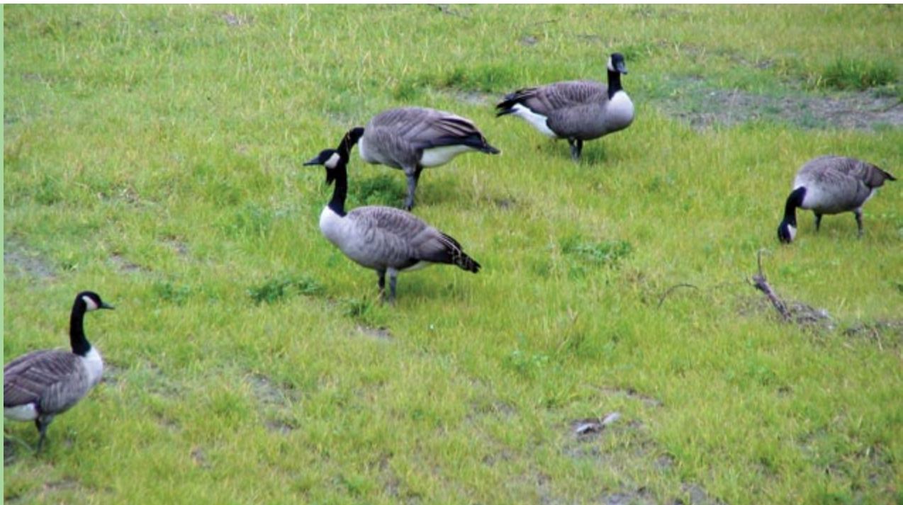
Canada geese in a seeded area of bay BE-07

Less than a year after bay BE-07 was developed, the tallyman concerned felt that the area offered such promising wildlife potential that he asked that no helicopters fly over the area during the spring goose hunt.