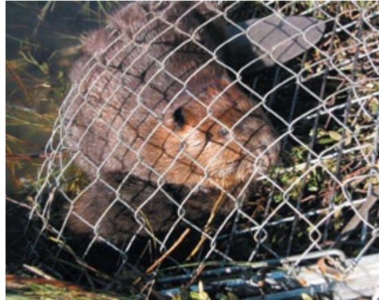
Beaver captured as part of a pilot project

The pilot project showed that, although technically possible, beaver relocation was very costly in terms of personnel, equipment and helicopter transport. Therefore, it was decided that the beavers would be trapped out before the reservoir was impounded. By fall 2005, the tallymen had trapped out 71 beaver colonies.