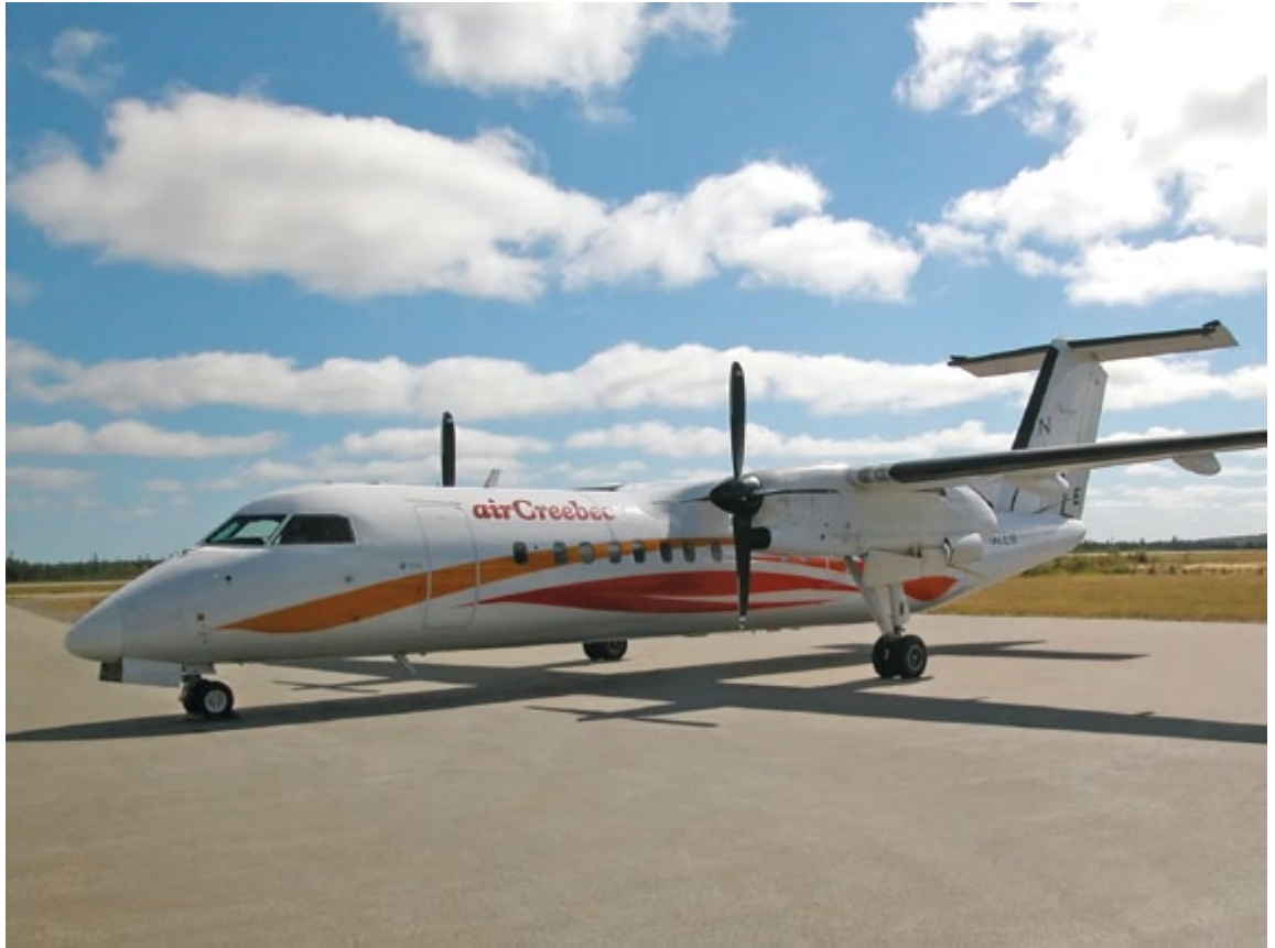
Air Creebec Dash-8 300

The economic spinoffs from project-related contracts and purchasing totaled $150 million in the Baie-James region, $135 million in Abitibi-Témiscamingue and $184 million in Saguenay-Lac-Saint-Jean.