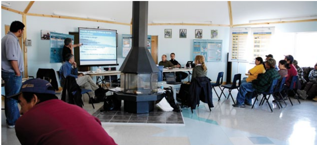
Information session in a Cree community

The Monitoring Committee visits the Cree communities on an annual basis to present a summary of the mitigation measures and environmental follow-up studies completed the previous year.