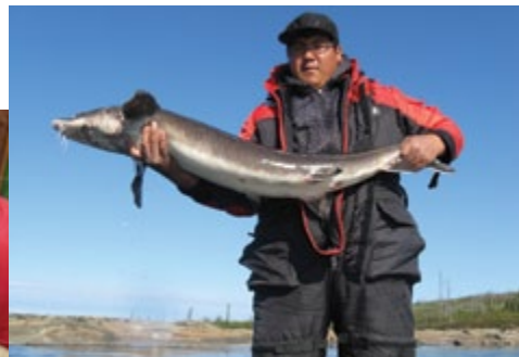
Cree participant fishing for lake sturgeon in the Eastmain