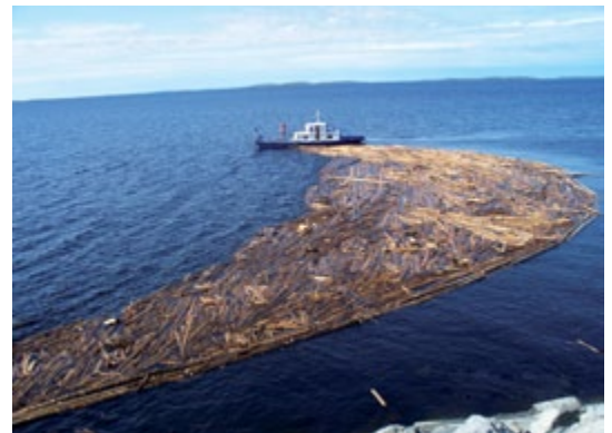
Removal of wood debris