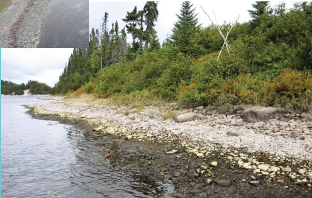
Monitored section of banks at KP 203 of the Eastmain