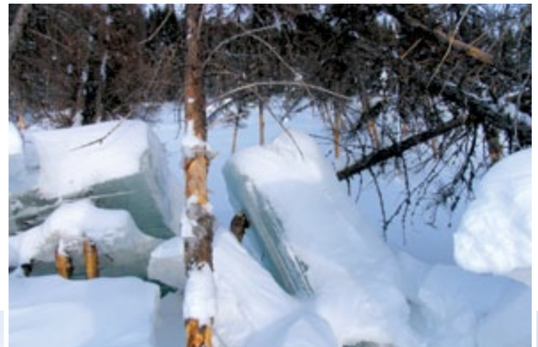
Deforestation in the reservoir by ice