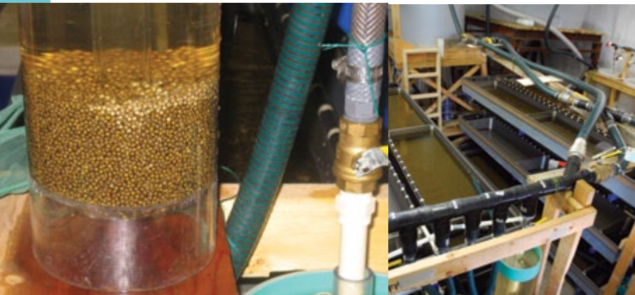
Incubating lake sturgeon eggs

Rearing lake sturgeon in a laboratory set up at Eastmain workcamp proved to be an innovative and effective solution.