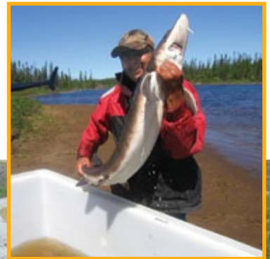
Release of a lake sturgeon into Eastmain 1 reservoir