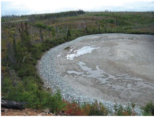
Banks protected with stone riprap downstream of KP 207

The flows released through the Eastmain-1 structures make it possible to maintain an instream flow of 140 m 3 /s at Eastmain-1 powerhouse.