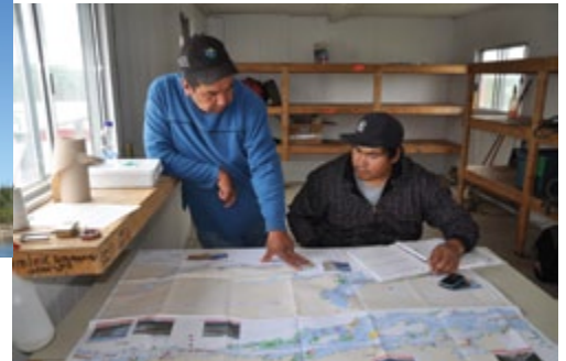
Crees helping to plan the wood debris inventories in Eastmain 1 reservoir