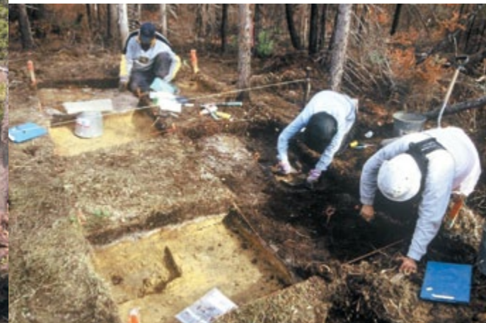
Excavation of an archaeological site near Eastmain workcamp