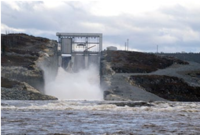
Spillway, looking downstream