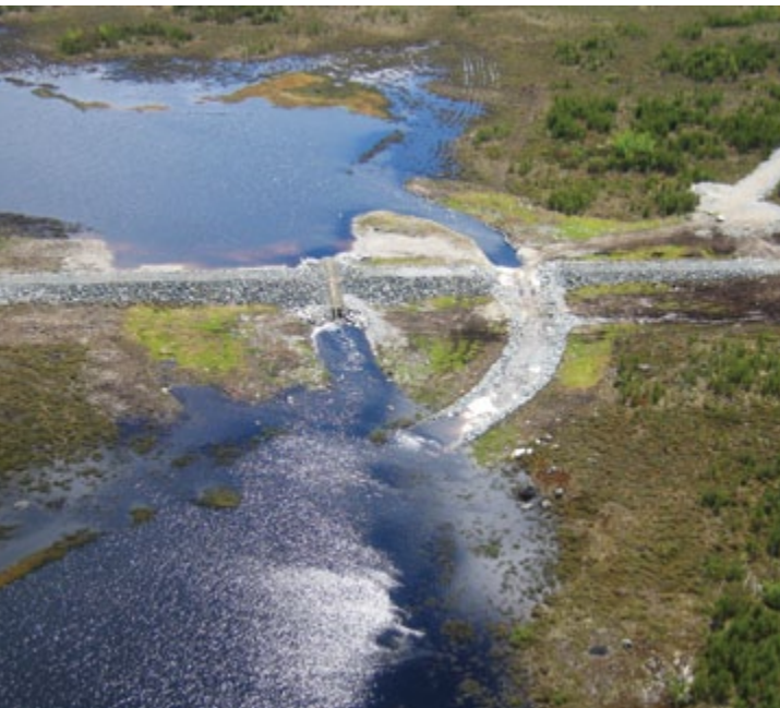
Dike and entrance to the fish pass in bay BE-07