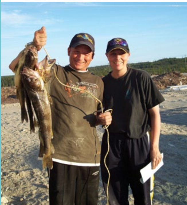
Angler with an employee of the Weh-Sees Indohoun Corporation