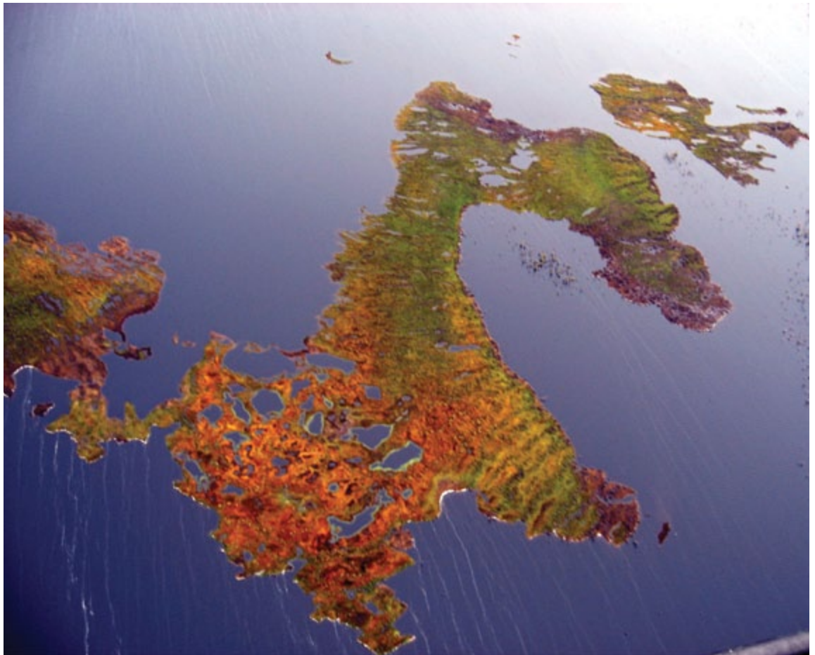
Floating peatland in the reservoir

Hydro-Québec needs to monitor floating peatlands in critical areas of the reservoir to ensure that they do not hinder operation of the facilities.