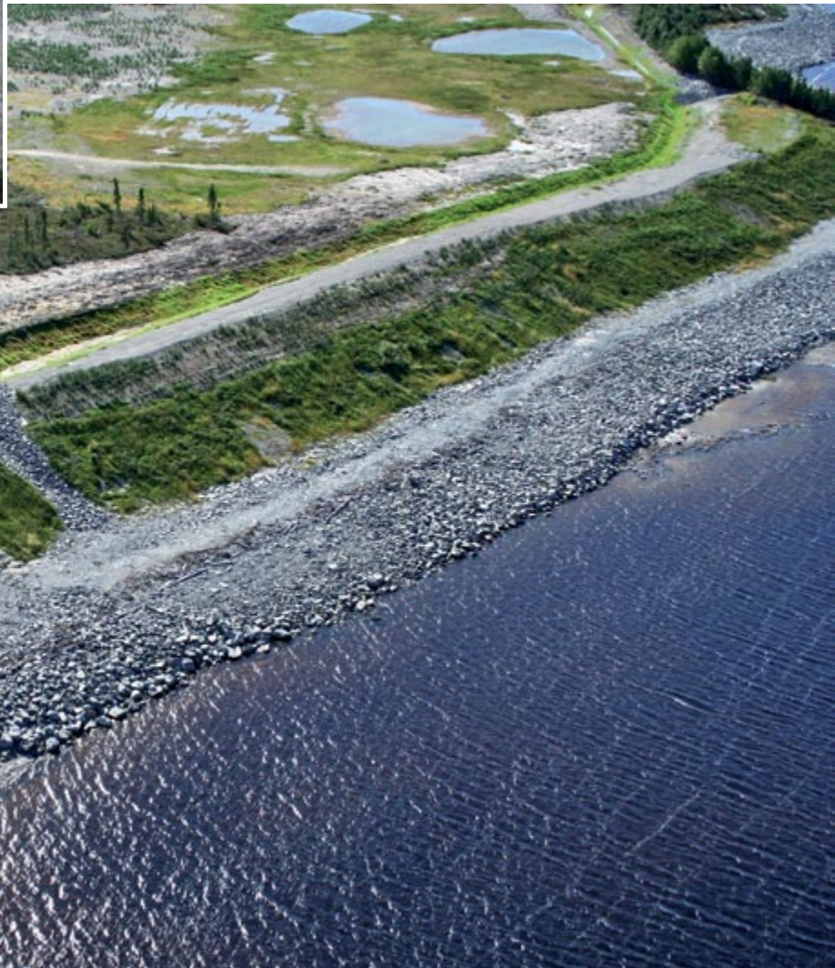
Vegetated drainage ditch at KP 214.5 of the Eastmain