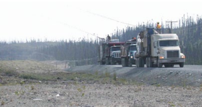
Hydroseeding along roads