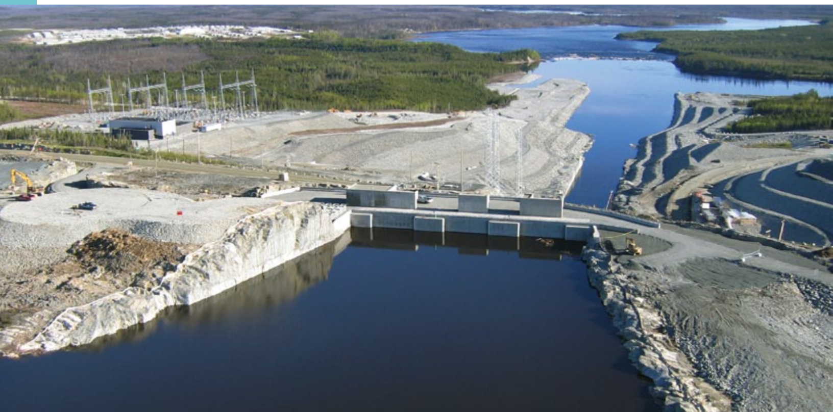
Eastmain-1 powerhouse intake