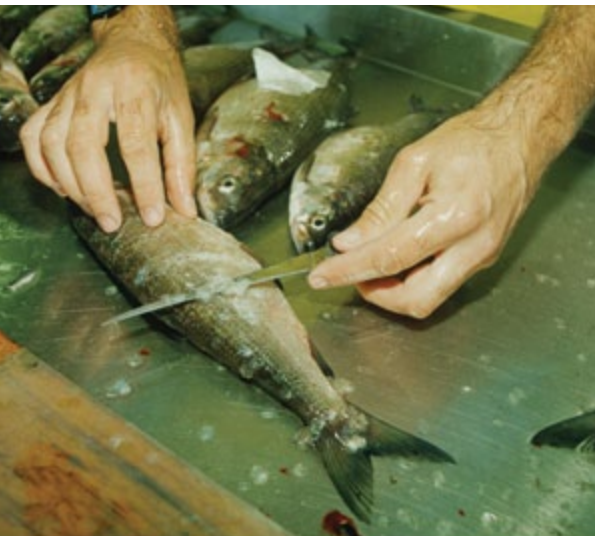
Sampling for analysis of mercury levels in fish