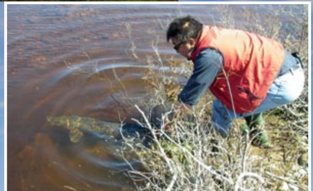
A Cree participant releases a sturgeon back into the water