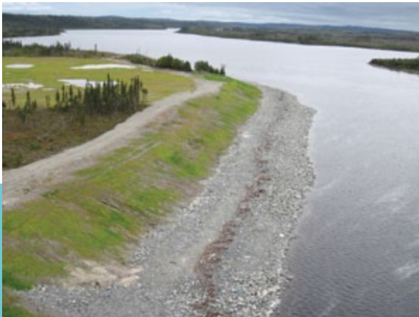
Slope protected with stone riprap at KP 214.5 of the Eastmain

At the end of the follow-up period in 2009, the physical integrity and effectiveness of the weir and bank protection structures were confirmed. The target areas are now stable and are little affected by erosion.