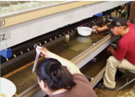
Crees working at the lake sturgeon production lab

Cree businesses obtained contracts worth $430 million to conduct these activities. In addition, by sharing and putting their traditional knowledge to use, the Cree communities and the tallymen of the traplines affected by the project played an active role in carrying out the environmental studies and work. Contracts were awarded directly to the tallymen for different types of work, including land clearing and removal of wood debris. This was a first for both SEBJ and the Crees.