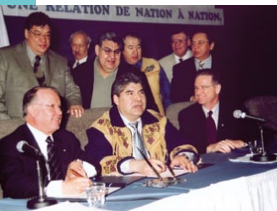
Signing of the Paix des Braves (2002)

The Agreement Concerning a New Relationship between the Gouvernement du Québec and the Crees of Québec (also known as the Paix des Braves) was signed on February 2, 2002. That same day, Hydro-Québec, SEBJ and the Crees of Québec signed nine agreements—one of which was the Nadoshtin Agreement —concerning the use of hydraulic resources in the Baie James region.