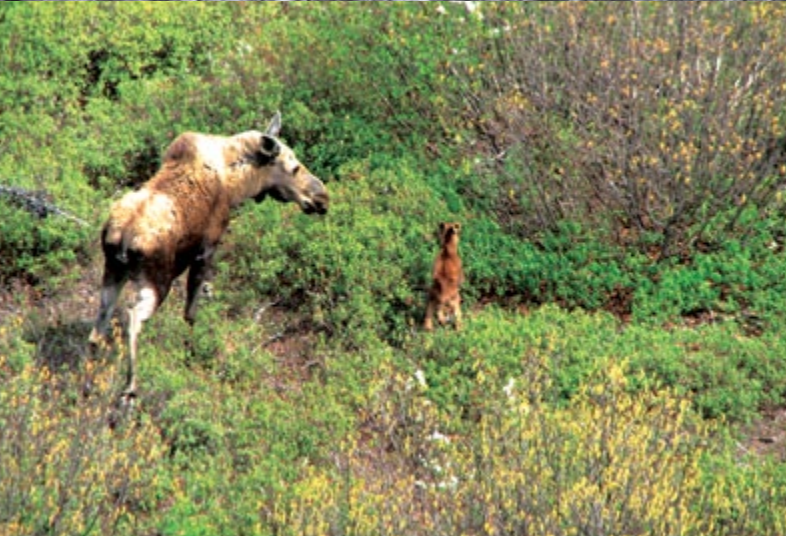
Moose cow with her calf