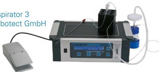
Aspirator 3 Labotect GmbH