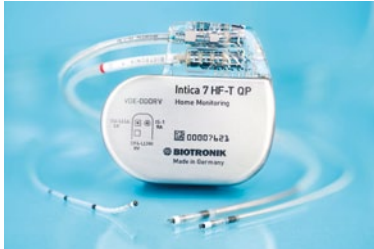
Neues CRT-D Implantat Intica 7 HF-T QP von Biotronik