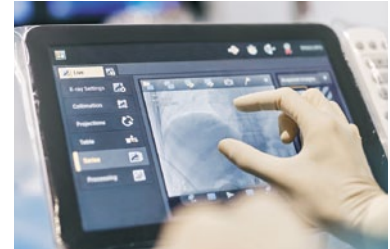
Philips Azurion: Innovative Bildgebungslösung