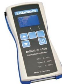
InControl 1050 Labotect GmbH