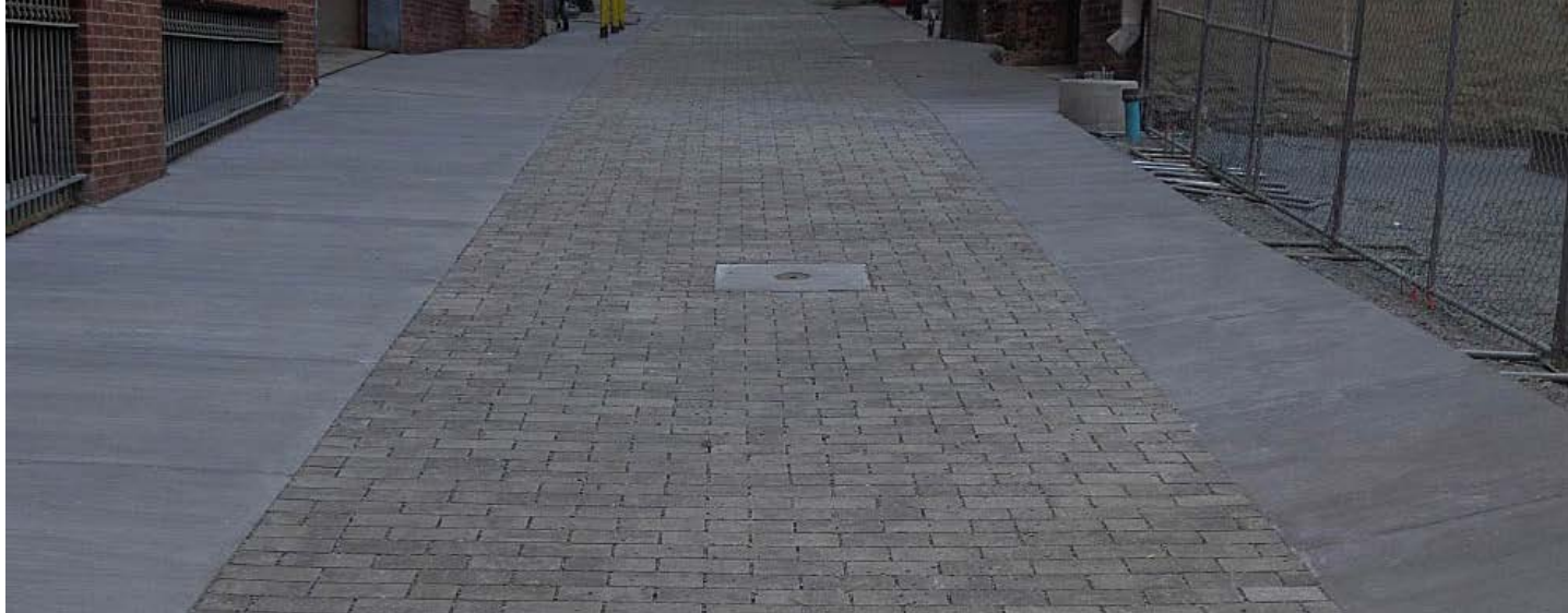
Figure 3. Green alley in Richmond, VA.