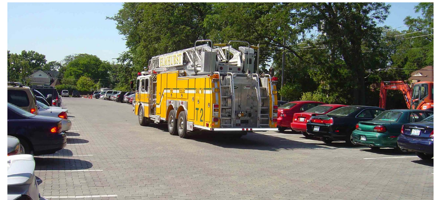
Figure 2. Parking lot in Elmhurst, IL.