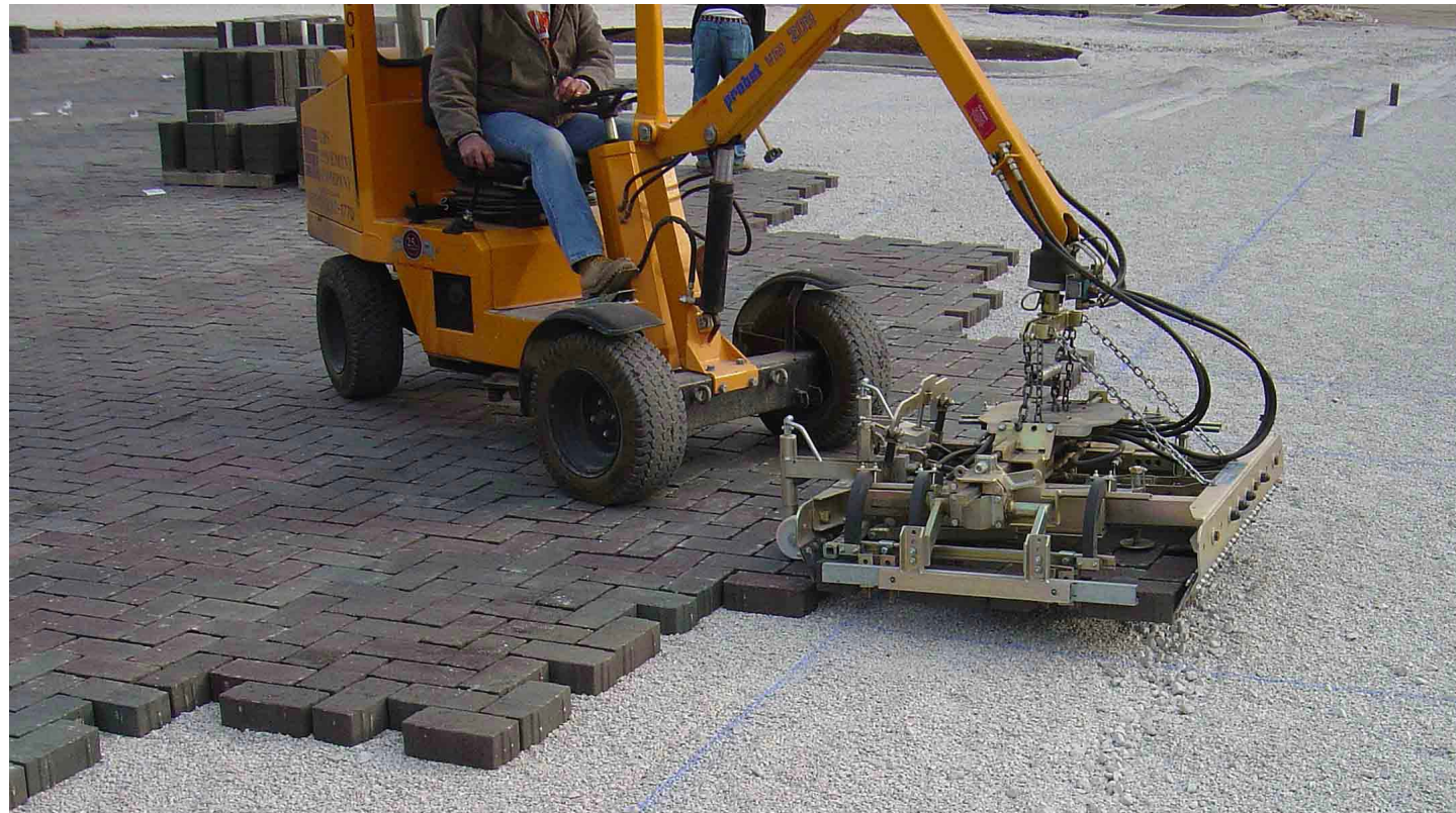
Figure 5. Mechanical installation of concrete paving units for PICP.