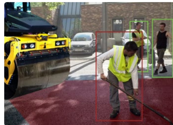
Pedestrian detection zone on a compactor - Blaxtair® recognizes all the pedestrians in its field, it warns the driver about the presence of the pedestrian in the danger zone.

they will immediately be scanned and classified and an alarm would alert the driver. This allows for ample reaction time. The whole process lasts only a fraction of a second. A pedestrian might escape the driver's notice, but none will escape Blaxtair®'s vigilance!