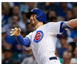
Former San Diego infielder Kris Bryant is the highest WCC draft pick ever going No. 2 overall in 2013.