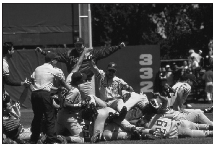
The Pepperdine Waves celebrate after winning the program's first-ever College World Series championship in 1992.