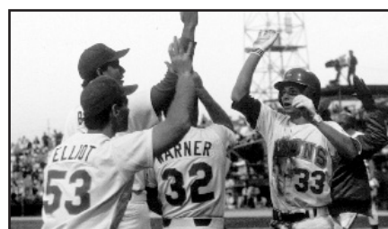
The LMU Lions made the program's first appearance at the College World Series in 1986.