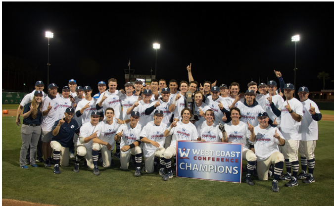
BYU Cougars - 2017 #WCCchamps