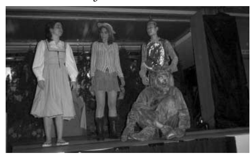
Some of the cast from 'The Wizard of Oz' production

2005–6 was a remarkable year for the Preston Society. With the May Week Musical now firmly established as a yearly tradition, this year saw the society's activities expand at an unprecedented rate. After the success of Return to the Forbidden Planet in Easter term 2005, the next year saw not just one but four further