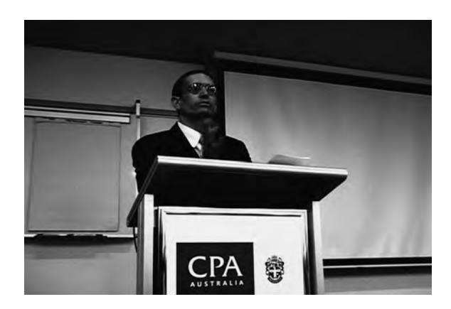
The Yes Men. Might Makes Right. 2001.

acts—as long as the speakers were "in positions of authority." They lacked such authority, but given a URL and a change of clothes, they could literally make-believe, convincing some people, some of the time, that they had it.<sup>32</sup> This is, perhaps paradoxically, both to use and to undermine the authority they target. The Yes Men put it this way: "It seems people can accept just about anything if you're dressed in a suit."<sup>33</sup>