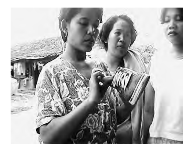
Blum. Two stills from My Sneakers. 2001.

with viewers, whose various configurations of knowledge and "horizons of expectation" determine whether something is plausible to them . While something similar is true of any artwork—that its meaning is produced in the encounter with the spectator—a parafiction creates a specific multiplicity.