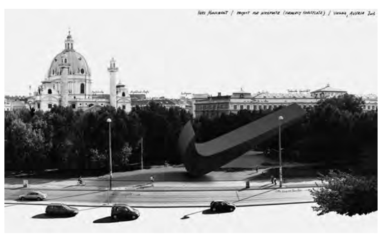
Top: 01.ORG (Franco and Eva Mattes) and Public Netbase. Nike Ground. 2003. Bottom: 01.ORG. Rendering of proposed