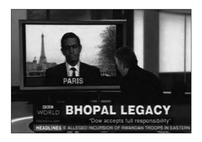
The Yes Men. Dow Does the Right Thing. 2004.

announcement (fitting that his name combined the patron saint of impossible causes and the world's end). One can only imagine their joy and corresponding disappointment when they learned that they still awaited justice. 40 Moreover, from some points of view any purposeful deception is inherently injurious. Consider the argument, which Sisela Bok put in ecological terms in 1978, that "... trust is a social good to be protected just as much as the air we breathe or the water we drink." Though the Yes Men may have outsmarted Rove in 1999, in some ways the work they went on to do is itself a "funhouse-mirror" of that operative's infamous techniques. Surely, the performativity they deploy is the jester's version of "We're an empire now, and when we act, we create our own reality." Such similarities can lead you to side with Bok and others who call for a return to honesty in personal and political communication. Or they can leave you agreeing with the Yes Men that precisely in such a climate, "we need to be devious in order to achieve a condition of honesty." (Just what social trust, after all, do we imagine we would preserve, in arguing against the use of deception in cultural-political