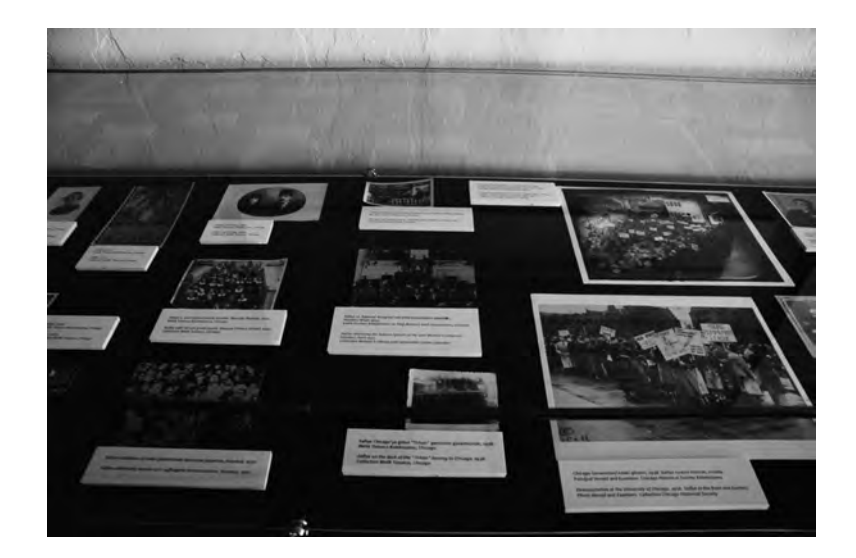
Blum. Detail of A Tribute to Safiye Behar. 2005.

However, this can be particularly destabilizing for scholarship. No matter