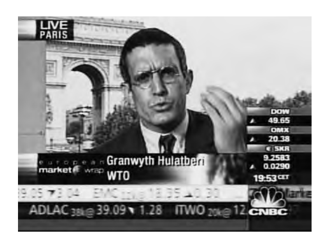
The Yes Men. End of the WTO. 2002.

positive identity correction, the target is made to announce strategies and transformations that are salutary from the point of view of the corrector, and that the actual person or entity must then choose to ignore or deny.<sup>28</sup>