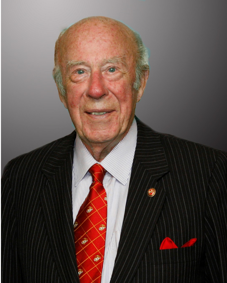
George P. Shultz, 2011