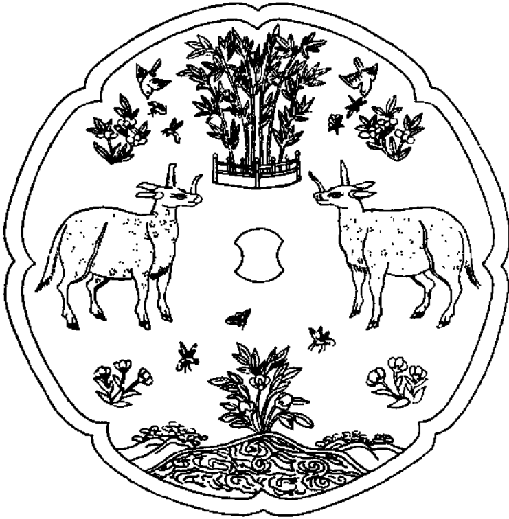
FIG. 5.—Chinese mirror. T'ang period (618-907). (After 72, chap. 40, p. 56.)

Metropolitan Museum. Could it not be assumed, therefore, that the double-horned variety is nothing but the traditional bovine animal with the straight horn on its forehead now supplemented by an additional nasal horn? In this case we would not have to assume a Chinese prototype for the two-horned version of the karkadann.