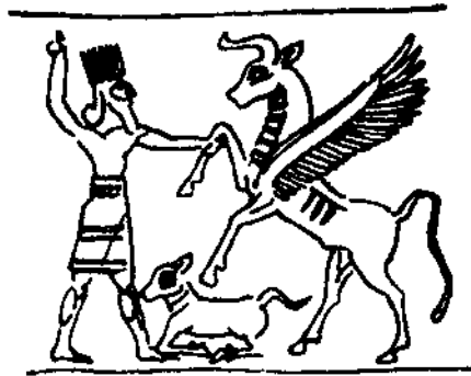
FIG. 1.—Seal impression. Divine hero killing a winged bull. Mesopotamia, ca. 1200 B.C. Formerly collection of Prof. Ernst Herzfeld. (After 123, pt. 2, fig. 135a.)

piece of architectural sculpture from outside Mesopotamia as the possible prototype, it might be better to look for an object from Mesopotamia itself, preferably an object of the minor arts. Scenes with a genius or king fighting a winged equine beast with a single horn on its forehead, as found on seals, give a good idea of what might have served as an indigenous model (fig. 1). 24 When one assumes such a survival of an age-old iconographic theme, one should also consider a local interpretation for the scene. One is led to this conclusion by the description of Persepolis in Ibn al-Balkhī's twelfth-century account of Fars. When discussing the same series of reliefs