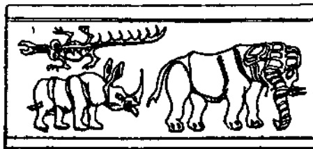
FIG. 2.—Indian seal found in Tell Asmar. Middle of third millennium B.C. (After 104a, fig. 108.)

These two sources (in the absence of earlier and more specific accounts which, it is hoped, will eventually turn up) lead one to assume that the Muslim belief in the elephant-rhinoceros fight belongs possibly to Indian folklore. Such an assumption is, to a certain degree, corroborated by the fact that the account of the fight occurs in the "Voyages of Sindbad" which are strongly permeated by Indian popular stories. 41 Here we find, furthermore, a clear statement of how the yarn was disseminated. In the second "Voyage" it is said that ". . . the sailors, travellers, and persons in the habit of journeying about in the mountains and lands have told us that this wild beast which is named the rhinoceros lifteth the great elephant upon its horn . . ." Thus it seems most likely that Muslim sailors