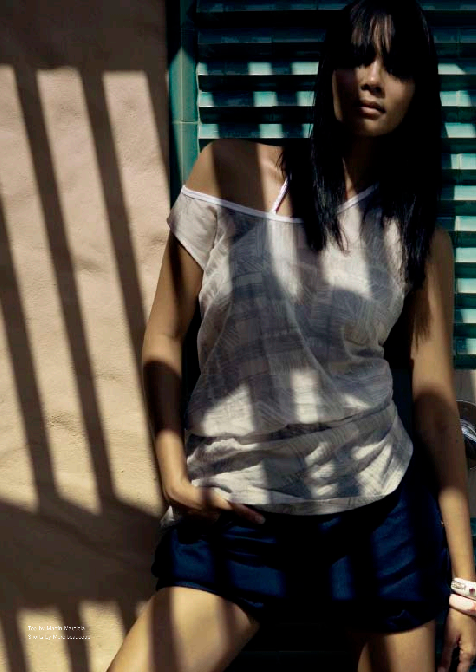
Top by Martin Margiela Shorts by Mercibeaucoup