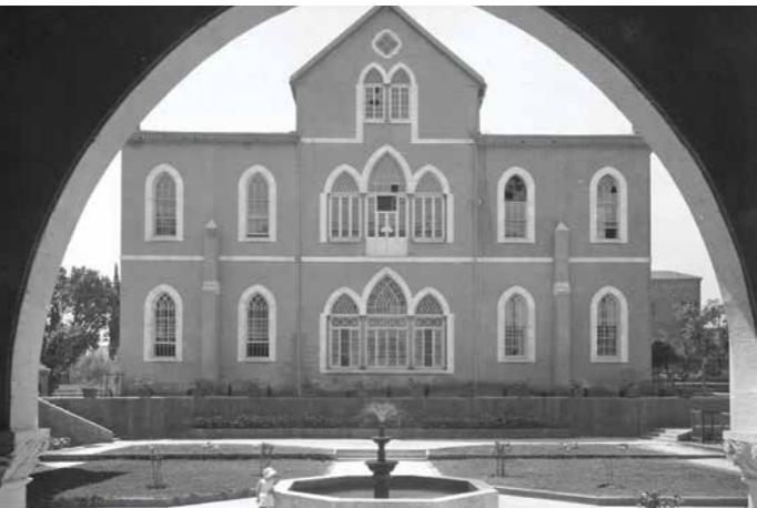
The Old Medical Building