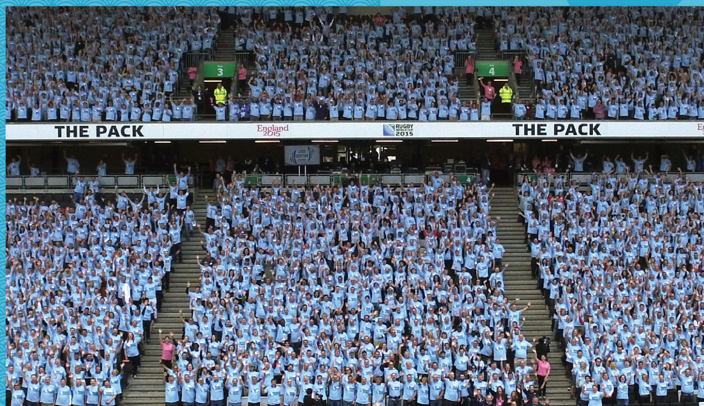
Volunteer programme for Rugby World Cup 2015™ (Hosting country: England)

As with previous Rugby World Cup tournaments, volunteers will play a major role in ensuring the success of the Tournament, providing a friendly welcome to all local and international fans and to showcase the best of Japan and the values of rugby. This is a one of a kind experience unique to Rugby World Cup!