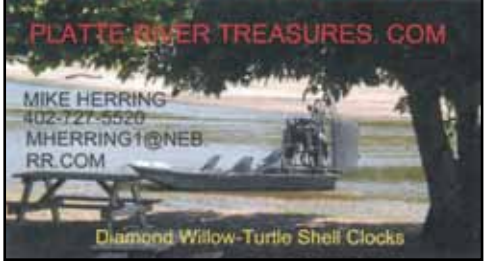
RiverTalk \bullet www.AirboatNE.com