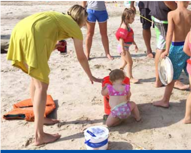
Anymore Jumping Frogs?