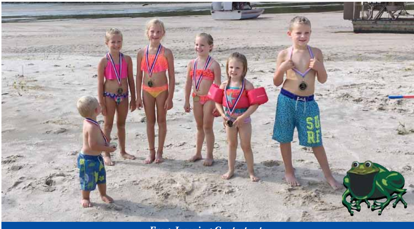
Frog Jumping Contestants