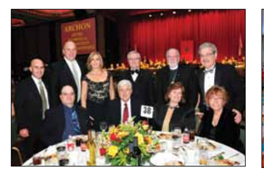
Archons, Archon-elects, and friends gather in fellowship during the Grand Banquet.