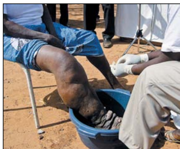
Legs of a Man with Lymphatic Filariasis.

cele have lagged behind mass drug distribution. It is critical that this gap be addressed. The drivers of success will be maintenance of high coverage, provision of resources for monitoring and evaluation, and efforts to understand the complexity of the interactions among coendemic conditions such as lymphatic filariasis, onchocerciasis, and soil-transmitted helminths; control or elimination interventions for all these conditions benefit from donated drugs. The success of lymphatic filariasis programs in Africa will also be influenced by the extent of coverage with bed nets impregnated with long-lasting insecti-