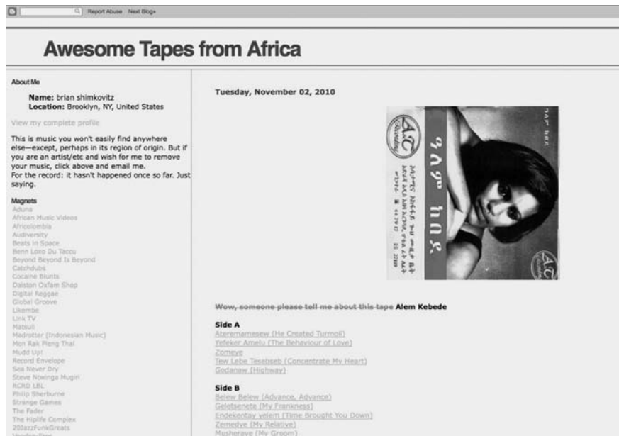
Figure 5 Awesome Tapes from Africa (a) original and (b) revised blog posts from November 2, 2010