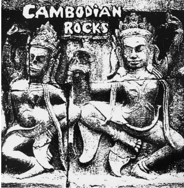
Figure 1 Cambodian Rocks (Parallel World)

to encounter the transformation of familiar music in an unknown cultural context. The effect was less like hearing a documentary presentation of a recognizable musical culture than tuning a radio to the staticky, somehow familiar sounds of a fuzzed-out, reverb-soaked Khmer version of “Gloria.”