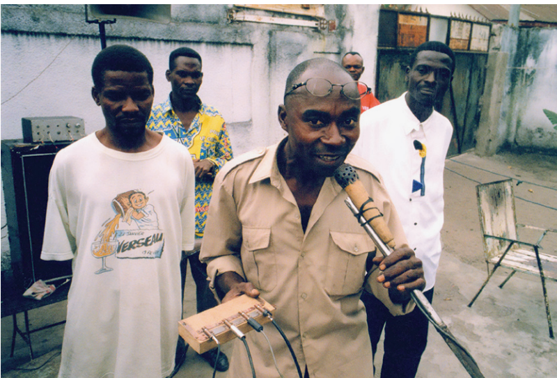
Figure 6 Press photos of Konono No. 1