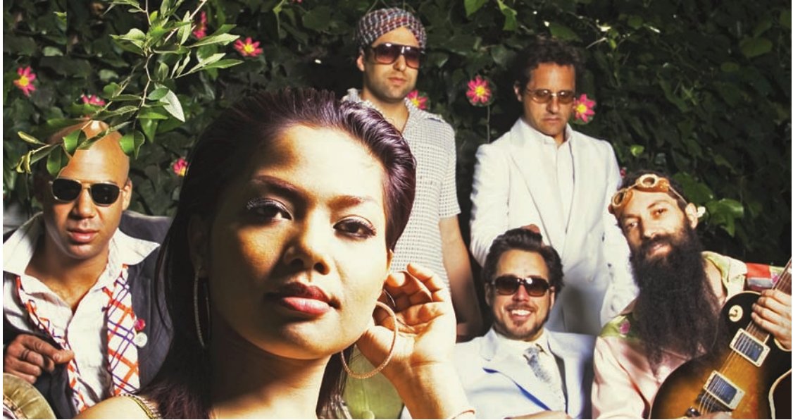
Figure 4 Dengue Fever