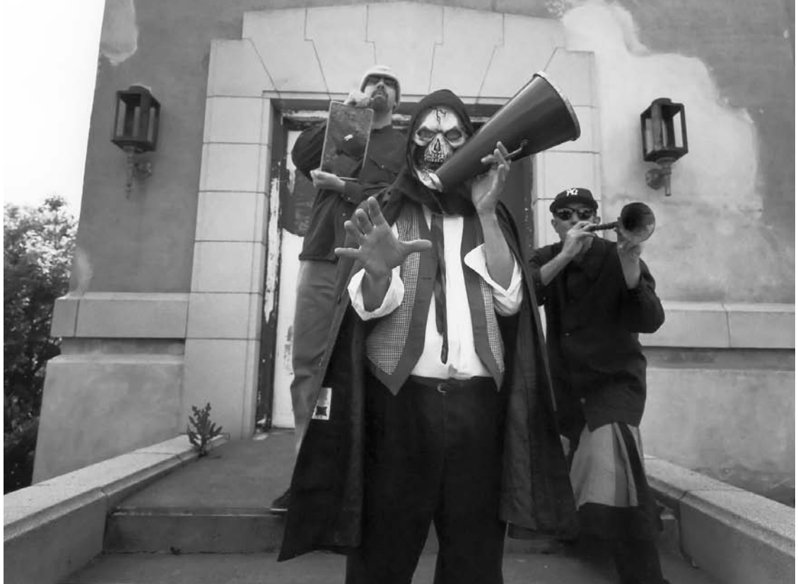
Figure 3 Sun City Girls. © 2003 (Toby Dodds)

from a fellow trader compiling North American experimental groups juxtaposed with tracks of Tuvan throat singing, Bollywood film music, or Inuit versions of Rolling Stones hits. This informal distribution mixed old and new content — from lo-fi tapes by an up-and-coming Noise band to out-of-print LPs of Filipino kulin-tang percussion borrowed from a local library — anything, as long as it was surprising and unknown. By the time Sun City Girls disbanded in 2007 (after Gocher's death), North American fans of independent music had developed a new interest in strange sounds from the global margins.