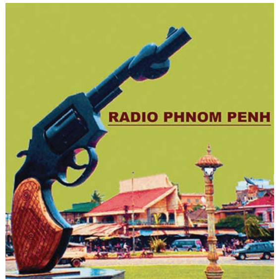
Figure 2 Sublime Frequencies covers: Shadow Music of Thailand; Radio Pyongyang; Group Inerane; Radio Phnom Penh