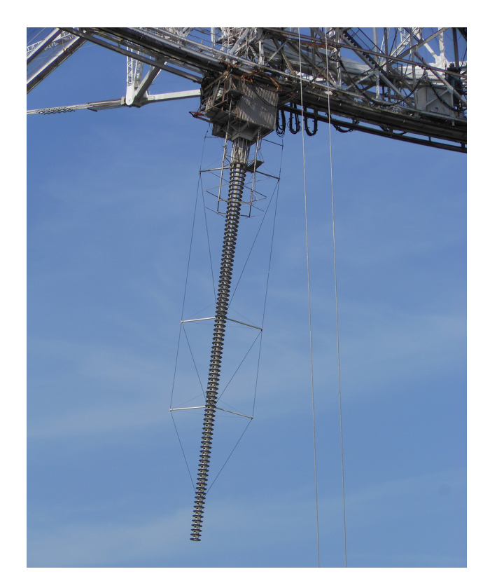
Figure 9. The modern 430 MHz linefeed and coaxial 46.8 MHz dual-polarization Yagi feeds as of August 2012. The 46.8 MHz feed is comprised of four, 3-element Yagi antennas and yields \sim 1.4^{\circ} full-width at half-maximum beamwidth and \sim 40 dBi gain (Mathews et al., 2010).

The Yagi antenna system (photo not available) that replaced the Fig. 8 log-periodic feed was located 2.16° "downhill" from the 430 MHz beam-center and was also towed by CH1. However, this arrangement prevented common volume observations with the two radars and was super-