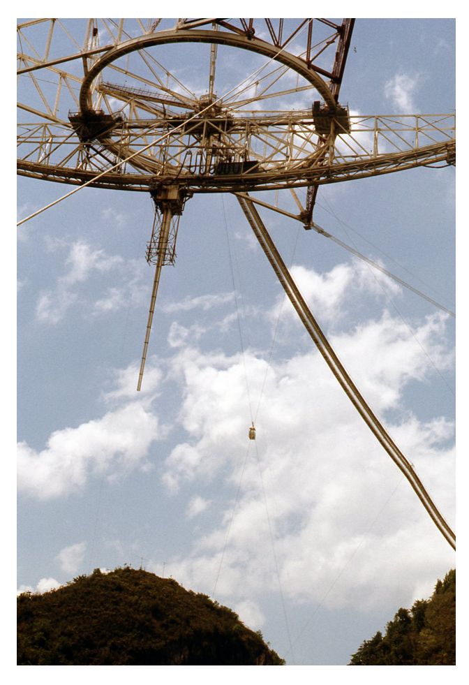
Figure 5. A picture from 13 May 1971 showing carriage house 1 (CH1) with the 40 MHz radar feed system consisting of four Yagi antennas placed symmetrically around the original square cross-section 430 MHz linefeed. Note the cable car giving convenient access to the platform relative to the catwalk which is located to the right and above the cable car in this photo.

While there are hints that this radar was installed at AIO for ionospheric heating experiments and for incoherent scatter observations in conjunction with the 430 MHz system (Watkins, 1967), it appears that the only published