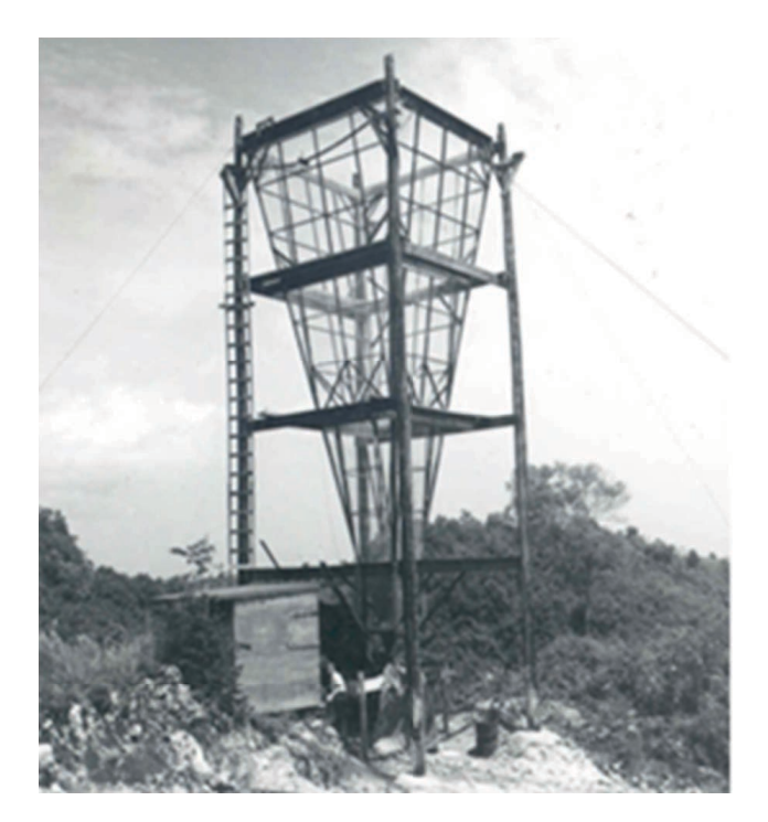
Figure 4. The first functioning radar feed at AIO. This 430 MHz hornfeed was constructed to test the full radar system before the dish was completed. This feed had a \sim 10^{\circ} half-power beamwidth and was in operation in mid-October 1962. It was used to receive the sun in transit and to obtain lunar echoes as the moon transited near zenith (Gordon, 1962a). Photo courtesy of Carmen G. Segarra-Saavedra (Segarra-Saavedra, 2012).