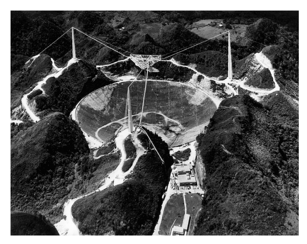
Figure 3. AIO at about the time it was dedicated on 1 November 1963. Note the 430 MHz linefeed projecting below the elevation arm – see Fig. 5 for a close-up picture of this linefeed. The waveguide from the transmitter located in the left side of the building nearest the dish is mounted above the catwalk that reaches from the triangle to near the base of the tower nearest the buildings and is then seen to reach from this point to the top of the cliff above the transmitter/operations building.

cross-section linefeed (Fig. 2) had a gain of only \sim 56\,\mathrm{dBi} and an aperture efficiency of only 22% (LaLonde, 1974). These values were well below the theoretical expectations for this system and would lead to the replacement of this linefeed. The contract under which this linefeed was designed and built is apparently described in Kay (1961) which the author has been unable to locate but which is referenced in LaLonde and Harris (1970).