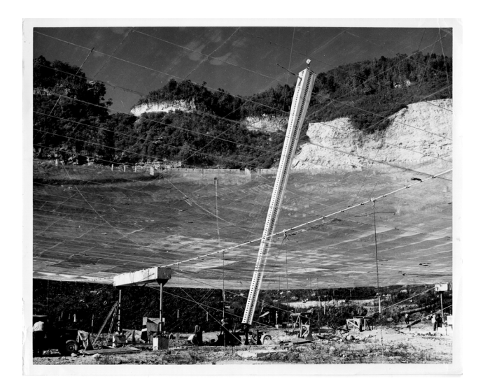
Figure 2. The original 430 MHz square cross-section linefeed as it was raised to the carriage house in this photo dated 14 August 1963.

1994). Gordon (1964) gives a delightful early history of AIO that emphasizes the versatility and potential of the facility and thoroughly supports the radio astronomy and planetary radar astronomy initiatives. These early thoughts are amplified in his oral history interview (Butrica, 1994). Details of the evolving science and of the individuals, institutions, funding sources, and politics behind Arecibo are given in Chapter 4 of Butrica (1996). Cohen (2009) thoroughly reviews the early history of Arecibo and the context that led to rapid construction of the facility. Rankin (2008) gives some details on life in Puerto Rico in the late 1960s along with a description of the computing environment at AIO and compelling details on the excitement surrounding early pulsar work.