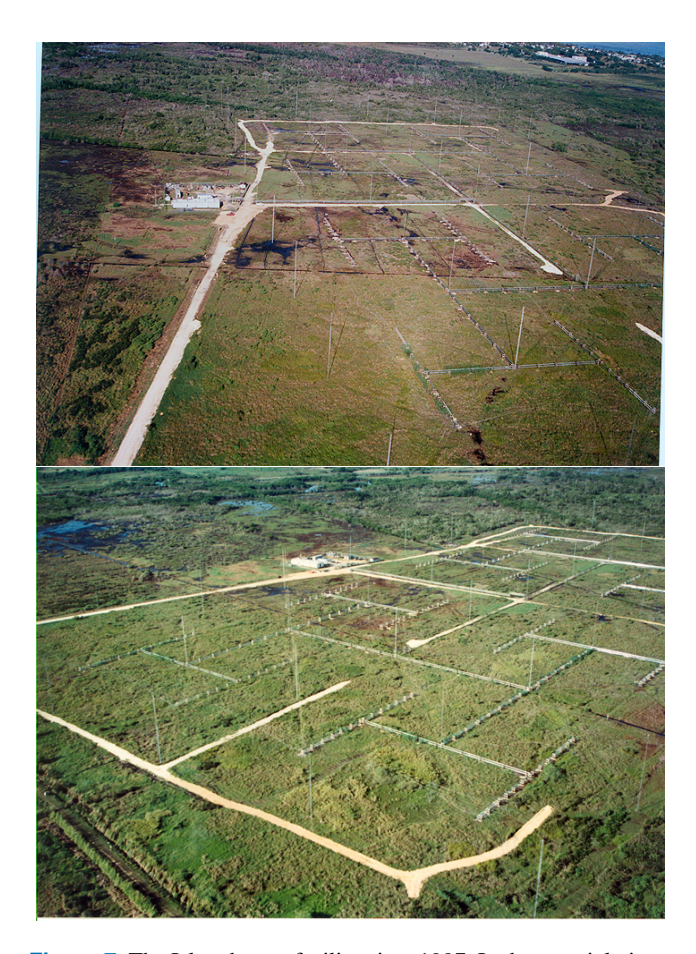
Figure 7. The Islote heater facility circa 1997. In these aerial views most of the two 4\times4 log periodic antenna arrays is visible with the transmitter/control building to the left/top and the ocean just visible at the top right. The dual, closed coaxial "cable" (constructed from irrigation pipe) transmission line system to the center of each log periodic feed is clearly visible as are the support towers. The wire log periodic feeds are not visible but are suspended from four towers with two linear polarizations each driven from a separate transmission line.

Transmission lines used in the first manifestation of this facility were open-wire pseudo-coaxial cables that resulted in severe mismatch and cross-coupling effects. These issues, along with diesel generator shortcomings, resulted in peak power limitations with a maximum at or below 400 kW. The HF facility was upgraded in stages, with new transmission lines beginning in September 1983 (NAIC Newsletter