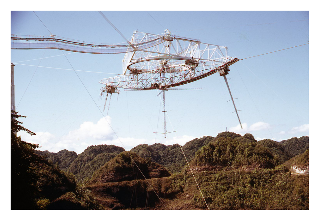
Figure 6. The Arecibo Observatory feeds in July 1972. The new 430 MHz linefeed is mounted on carriage house #1 to the right in this photo. In the center is the HF log-periodic feed for ionospheric heating experiments. To the left is carriage house #2 with various radio astronomy feeds including those at 318 MHz (left, 40 feet long), 611 MHz (right, 45 feet long), the far-right feed is likely 1667 MHz test feed while the feeds at the far left are likely nested Yagis at 111 MHz and 196 MHz (D. B. Campbell, personal communication, 2013). Note the catwalk at the upper left of the photo.

However, the 6-inch coaxial cable from the transmitter room to the platform found use for delivering power to the first of the on-dish HF heater antennas. It is possible that the radar was decommissioned simply to use the co-axial cable to deliver HF power to the heating antenna. However there was an unsuccessful attempt to convert this system to 50 MHz using a single large transmitter tube and a socket-located resonant cavity "tank" circuit provided by the NBS (National Bureau of Standards; or perhaps ESSA per the next section) in Boulder, Colorado (J. B. Hagen, personal communication, 2013).