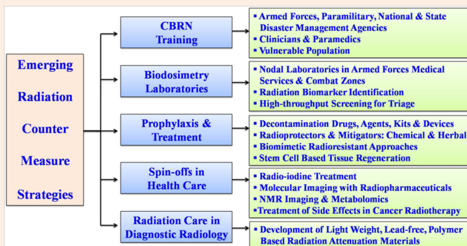
Figure 2: Components of emerging radiation countermeasure strategies.