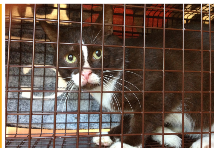
Tip 5: Remove yourself from the immediate area, but stay close so that you can check the cage as often as possible.

Tip 4: After setting the trap, it may be helpful to cover the cage with a blanket or burlap sac. Cats often venture into enclosed areas, so covering your trap may result in a quicker catch.