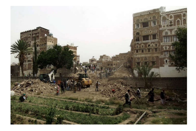
Figure 4. Buildings of in the Old City of Sana'a in the aftermath of the air strike of June 2015.

The World Conference on Disaster Reduction (WCDR), a specialist meeting on cultural heritage risk management hosted in Japan since 2005, laid the basis of the 'International training course on disaster risk management of cultural heritage' held in various forms since then in Kyoto, Kobe and Sasayama.