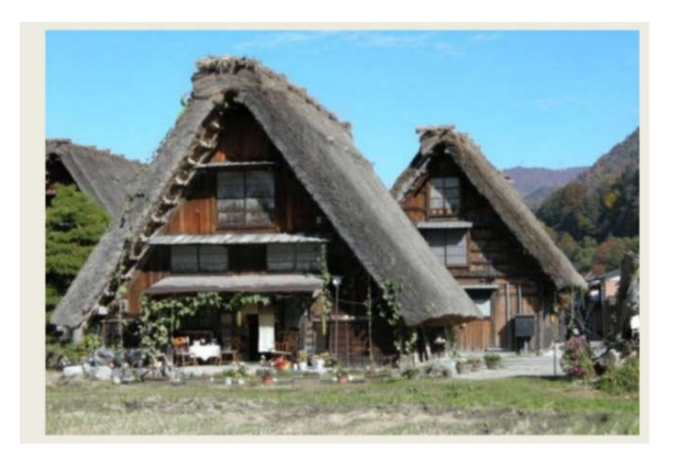
Figure 5. A Minka building, a traditional house in Japan, with roofs covered by straw and wooden structures.

It is an important proactive approach to be held in high esteem as Japan holds a heritage of residential buildings made of wood or other natural materials worthy of note and encourages the use of active ecological tools to maintain both this type of construction (Figure 5) and the natural habitat, with which man has cooperated since ancient times, intervening in some areas to mitigate the risk of disasters.