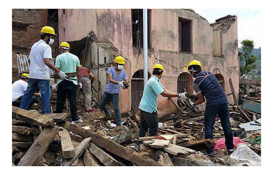
Figure 3. Operations of salvage of the mural painting fragments at Shantipur guided by the International Centre for the Study of the Preservation and Restoration of Cultural Property (ICCROM) experts and other international partners in the aftermath of the earthquake in Nepal, 2015.

First of all, providing an effective first aid response is crucial. In the event of disaster, working relationships and communication networks need to function effectively where normal communications may be compromised. This is a necessary phase for rebuilding better, stabilizing and securing the damaged structures, and recovering collections (Figure 3).