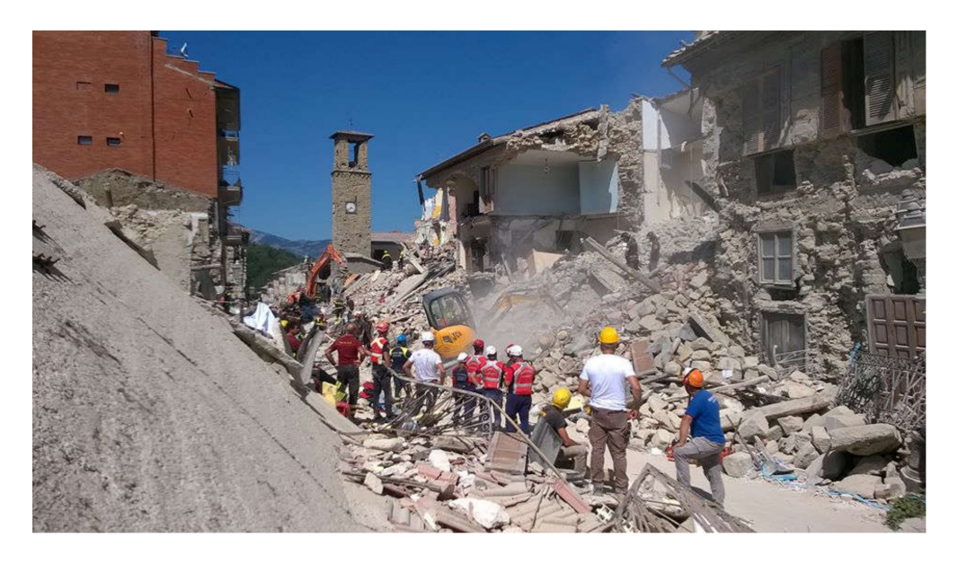
Figure 7. Salvage operation after the earthquake of August 2016, which destroyed the historic center of Amatrice. After one year, rubble is still on the streets. Photograph: Roberto Salustri.

On the other hand, specific protocols, social tools and multimedia platforms should be enhanced, both in Italy and in the Balkans, in order to strengthen risk prevention, funding and preparedness as well as to reduce cultural heritage vulnerability. According to the recent press news and the surveys of the volunteers of the association of RESEDA Onlus in the region of Amatrice, with reference to responding to affected people needs, the institutional means and intentions are still inadequate (Figure 7).