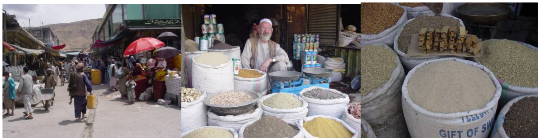
Opium market in Northern Zone

The opium markets and laboratories operate in all times in year. The markets consist of 40 main, 80 local and 19 cross-border markets; the laboratories comprise 19 main, 70 local, and 1 cross border heroin/morphine processing labs. The main markets are located in central town of regions while the local markets are located in villages. Cross border opium markets are near to the main border crossing points.