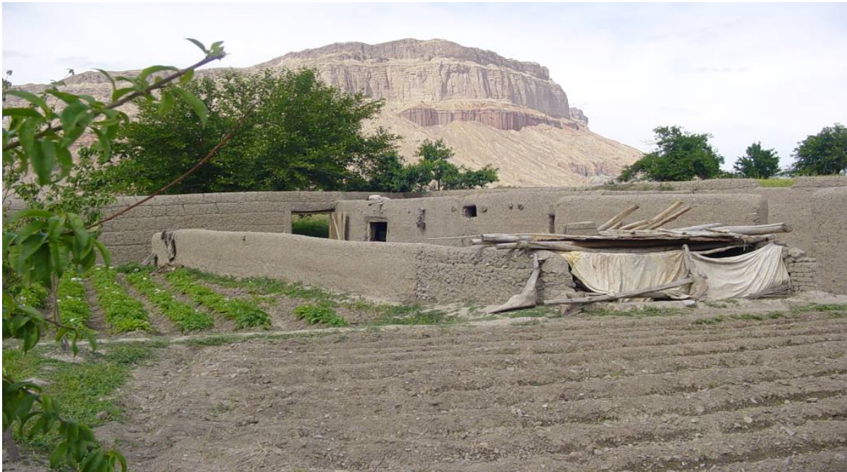
Morphine lab in northern zone

The morphine/ heroin production labs need simple equipments such as stove, iron barrel and locally made pressing machines with Jack. Such labs can be established in a small space of 1-2 rooms. Processing labs are hidden with restricted access to the people managing the lab and main market dealers. Mobile processing labs were also observed in east, south and western regions. Such labs are fixed on the back of trucks with large cylindrical containers and gas fire-stoves.