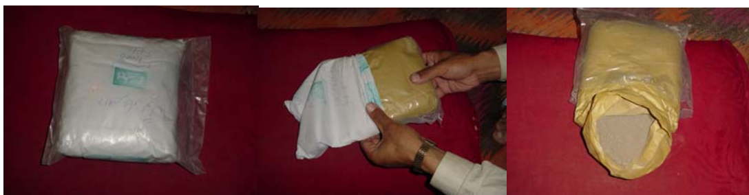
Morphine pack of 1kg

There are few crystal heroin production labs in Afghanistan in the border areas. These are totally hidden. The name, type, price and amount of the main chemicals needed for production of 1 kg of heroin have been summarized in Table 6.