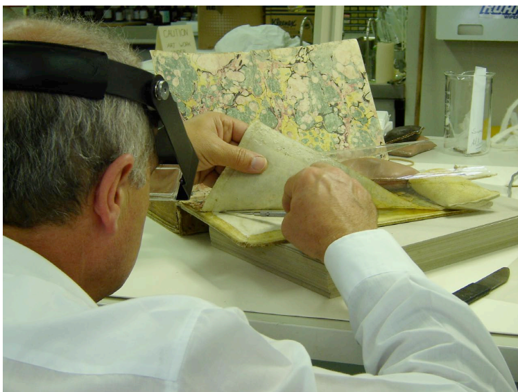
Figure 2. Volume one endpapers removed from cover.