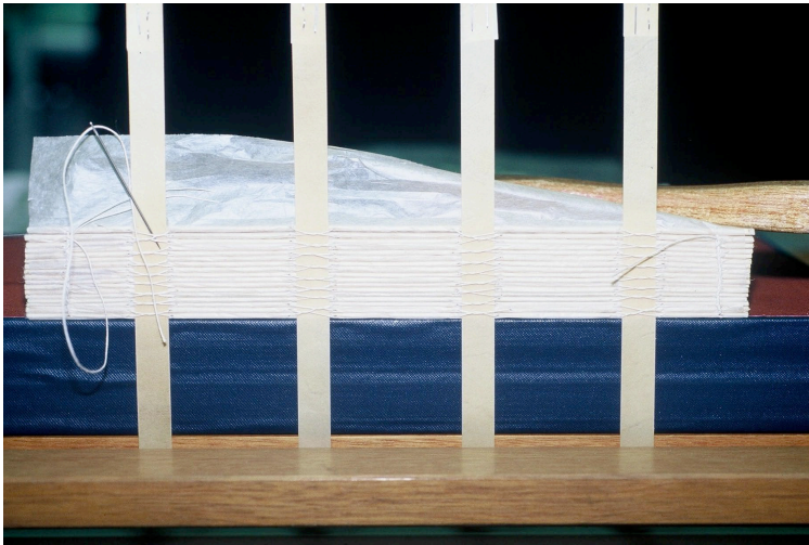
Figure 4. Resewing volume two with Japanese gampi paper.