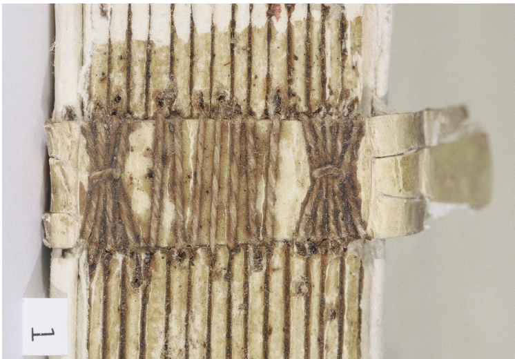
Figure 1. Original sewing of volume one with example of 'tacketing'.

Volume one had five pieces of heavy scrim (a heavy muslin) adhered with animal glue on the text-block spine in between the vellum sewing supports and behind the head and tail headbands. The vellum headband core was still attached to the volume, however the original silk headband had deteriorated but for tie downs found in the text block. The headband colours were warm tan and beige.