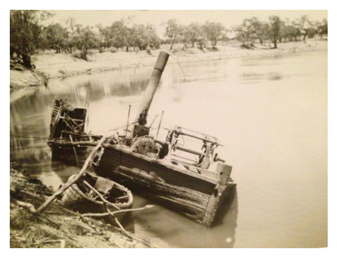
PS Hero at Boundary Bend. Unknown photographer and date. Circa late 1960s.

Sadly, in January 1957, the PS Hero caught fire at Boundary Bend and sank. Over the years it was stripped and slowly deteriorated. Its paddle wheels were removed and installed on the PV Pride of the Murray.