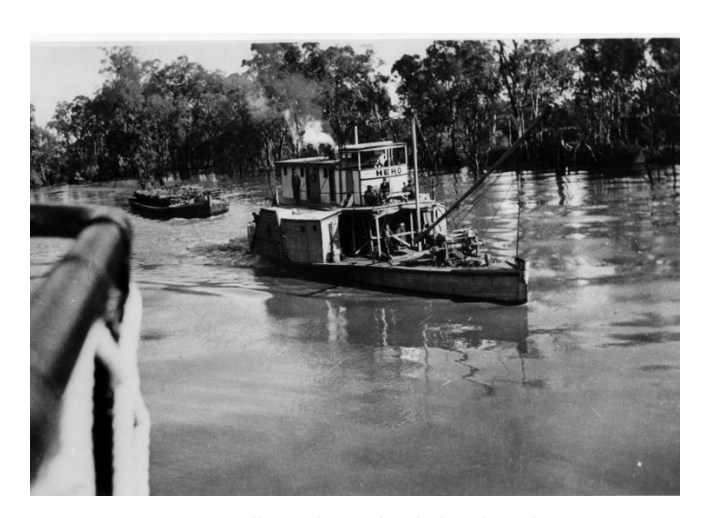
PS Hero pulling a barge loaded with timber. Unknown photographer and date. Possible when it was owned by the Forests Commission, Circa 1943.

At one stage, annual production was upward of half a million tonnes. Most of the labour was provided by Italian internees.