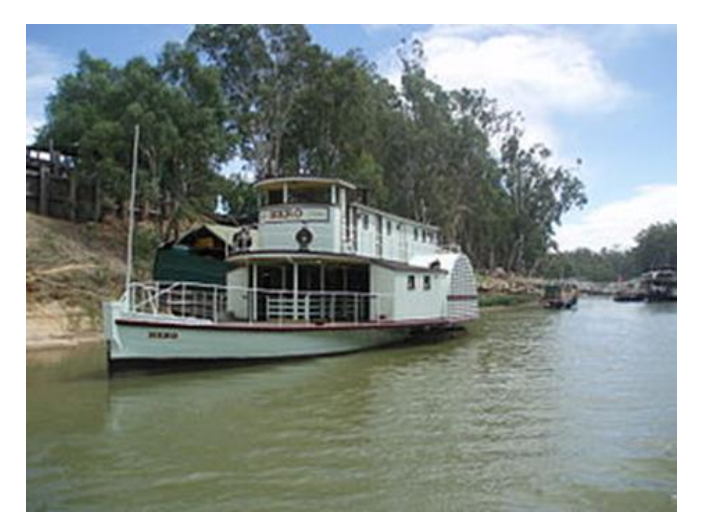
Restored PS Hero - Echuca. 2008.

The Murray River was first navigated in 1853 by William Russell and Francis Cadell who responded to the South Australian Government's £2,000 competition to open the Murray as a waterway.