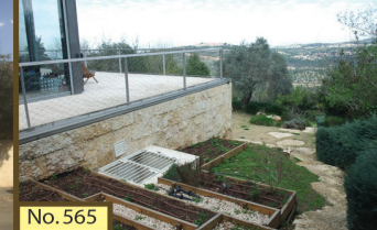
No. 565 Ramat Raziel-440/2,150 sqm, high standards villa