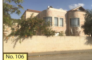
No. 106 Beit Zayit-lovely villa, 245/860 sqm, big potential