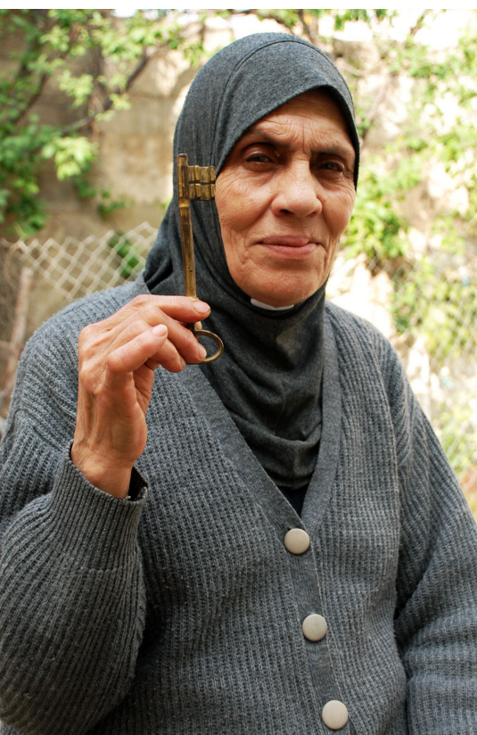
This resident of Beddawi, like so many refugees, has kept the key to her family's home in Palestine, which she left in 1948.

12 Dbayeh: Home to about 4,000 refugees, most of them Christian Palestinians who arrived in the mid-1950s from the Galilee. UNWRA estimates that one in four structures were damaged or destroyed in 1990 as a result of Lebanon's civil war.