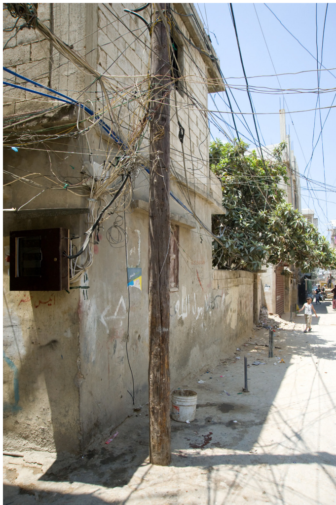
These narrow mazes of paths and low hanging wires overhead in Ein El Helweh are ubiquitous to every camp in Lebanon.