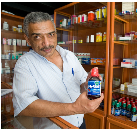
ANERA supplies the only hospital inside Ein El Helweh, the largest camp in Lebanon, with 30% of its total drug supply.