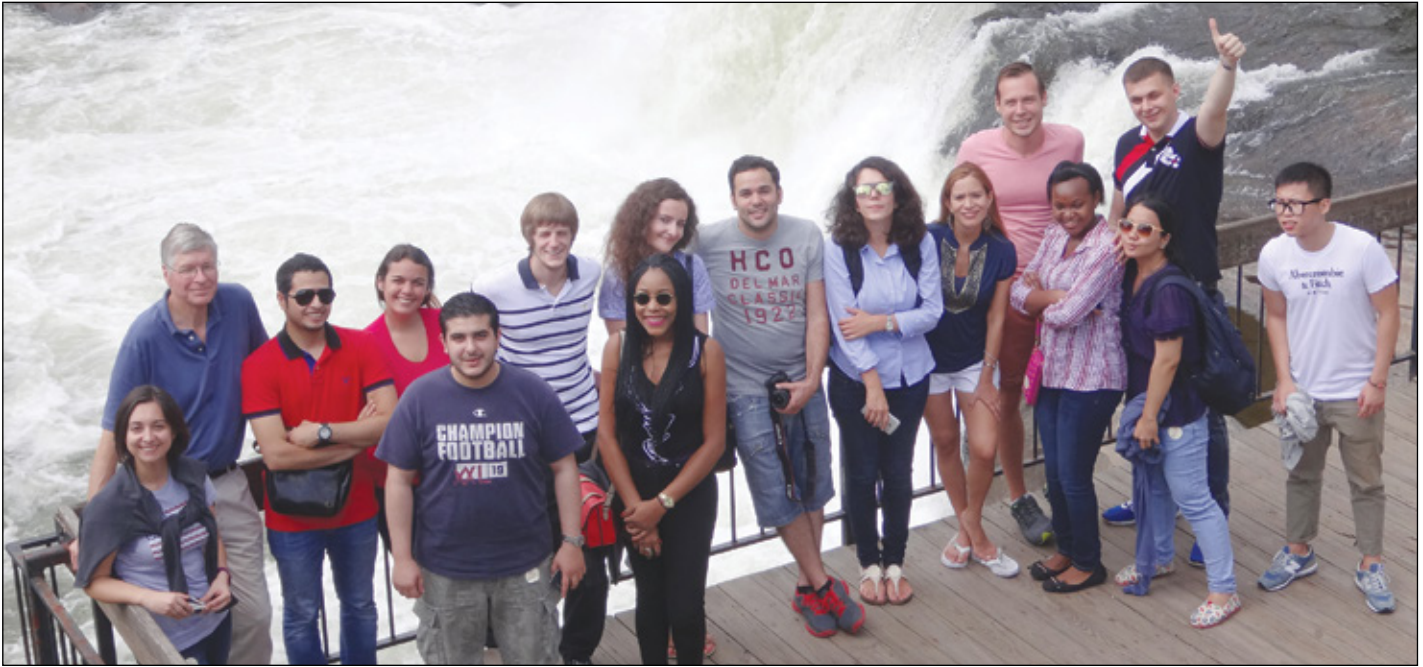
Class of 2015 enjoys a stop at Obiopyle before classes start