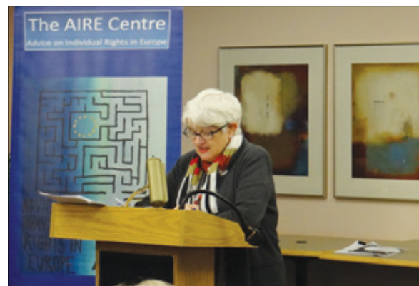
Nuala Mole delivers a lecture on “European Human Rights for Commercial Lawyers” at Pitt’s School of Law, October 2013

voting rights, and extra-territoriality and military operations. On October 17, she lectured to the public on “European Human Rights for Commercial Lawyers.” Mole has conducted training for the Council of Europe, the European Commission, and the AIRE Centre for judges, public officials, lawyers, and NGOs in 40 of the 47 Member States of the Council of Europe. ✦