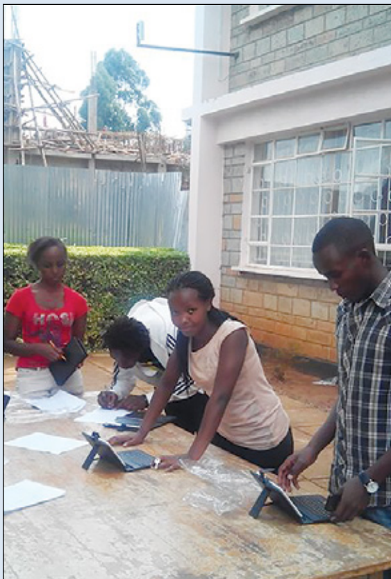
Moi University first-year students receive their Surtab Tablets