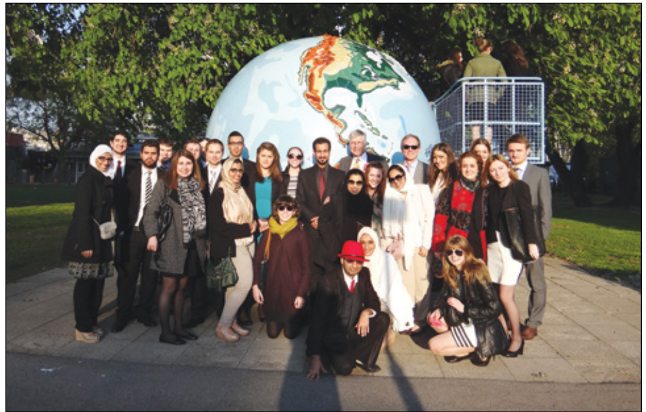
Members of the Pitt Consortium enjoy a break from the Vis Moot at the Prater in Vienna, Austria, April 2012