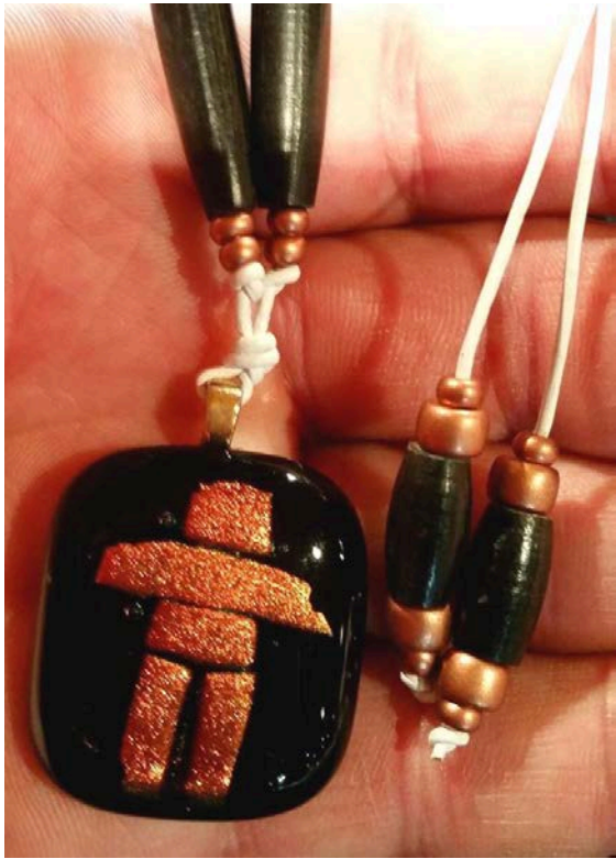
EXHIBIT 1 Fused-Glass Inukshuk Pendant