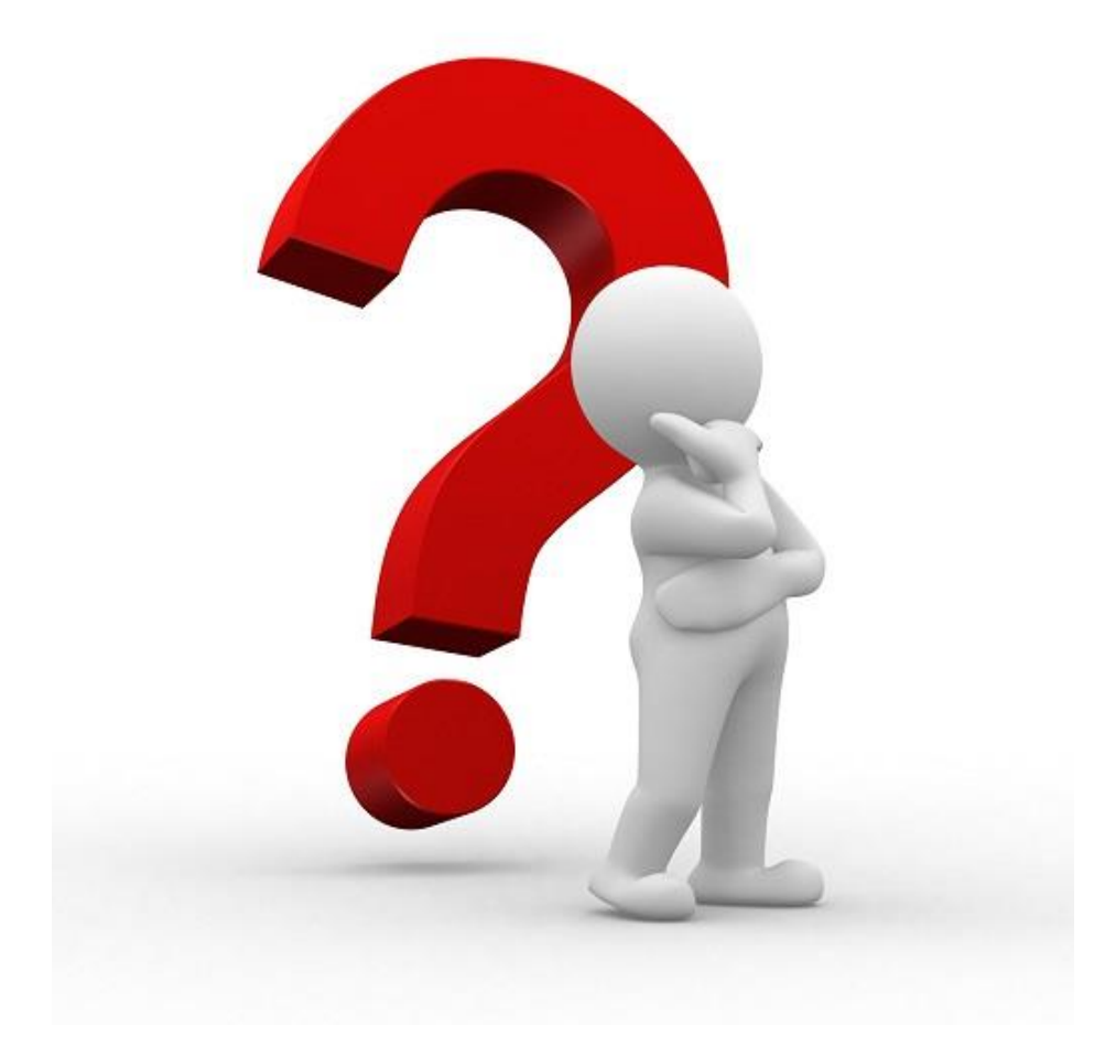
So where did the extra 365 votes come from???