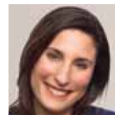
Rosalind Wiseman Queen Bees & Wannabes ATLANTA