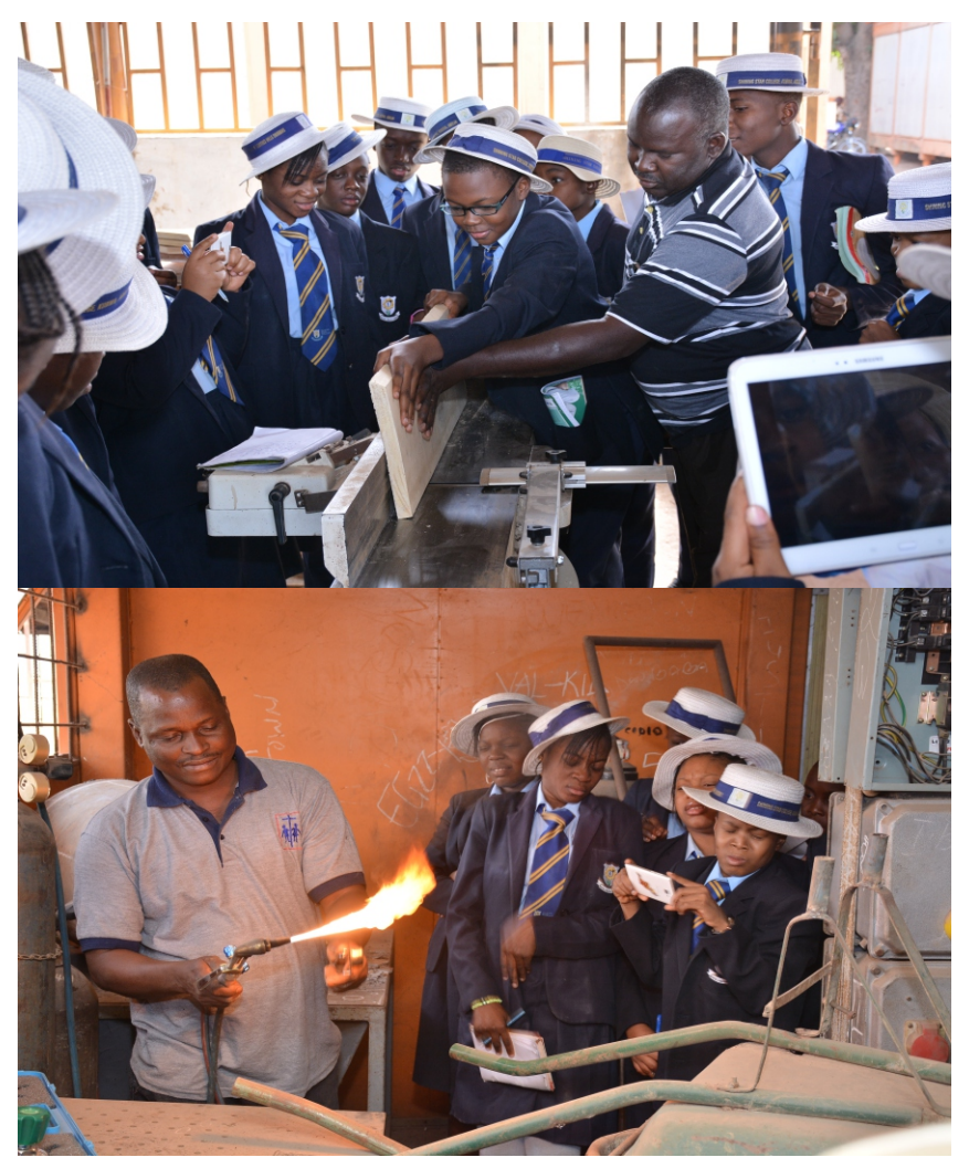
Basic Science Students on a visit