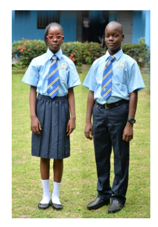
Mondays and Thursdays Wear