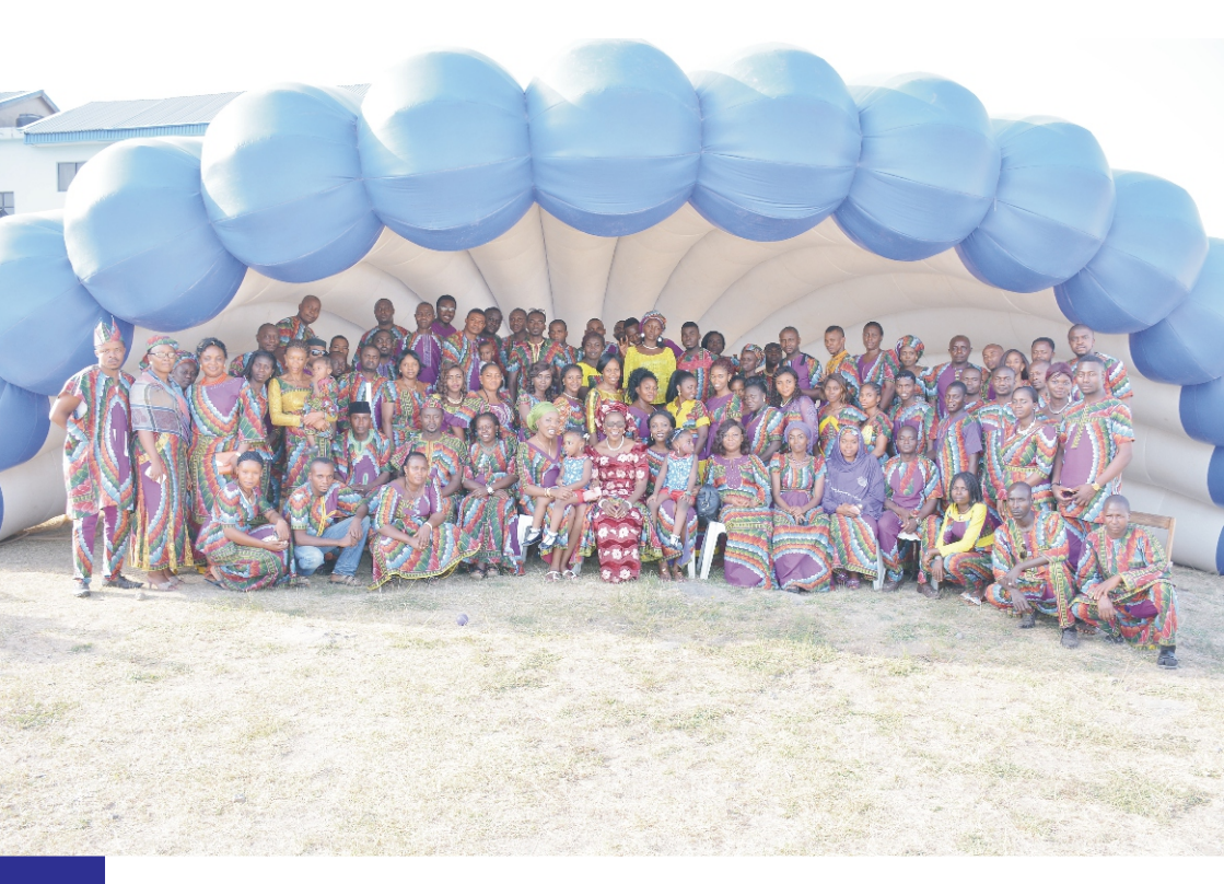
EVC, Directors and Members of Staff at the Shining Star FUNFEST, December 2015

PRIZE GIVING DAY/END OF SESSION ACTIVITIES