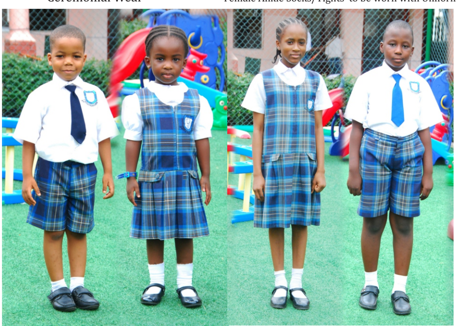
Pre-Nursery to Nursery 3 Wear