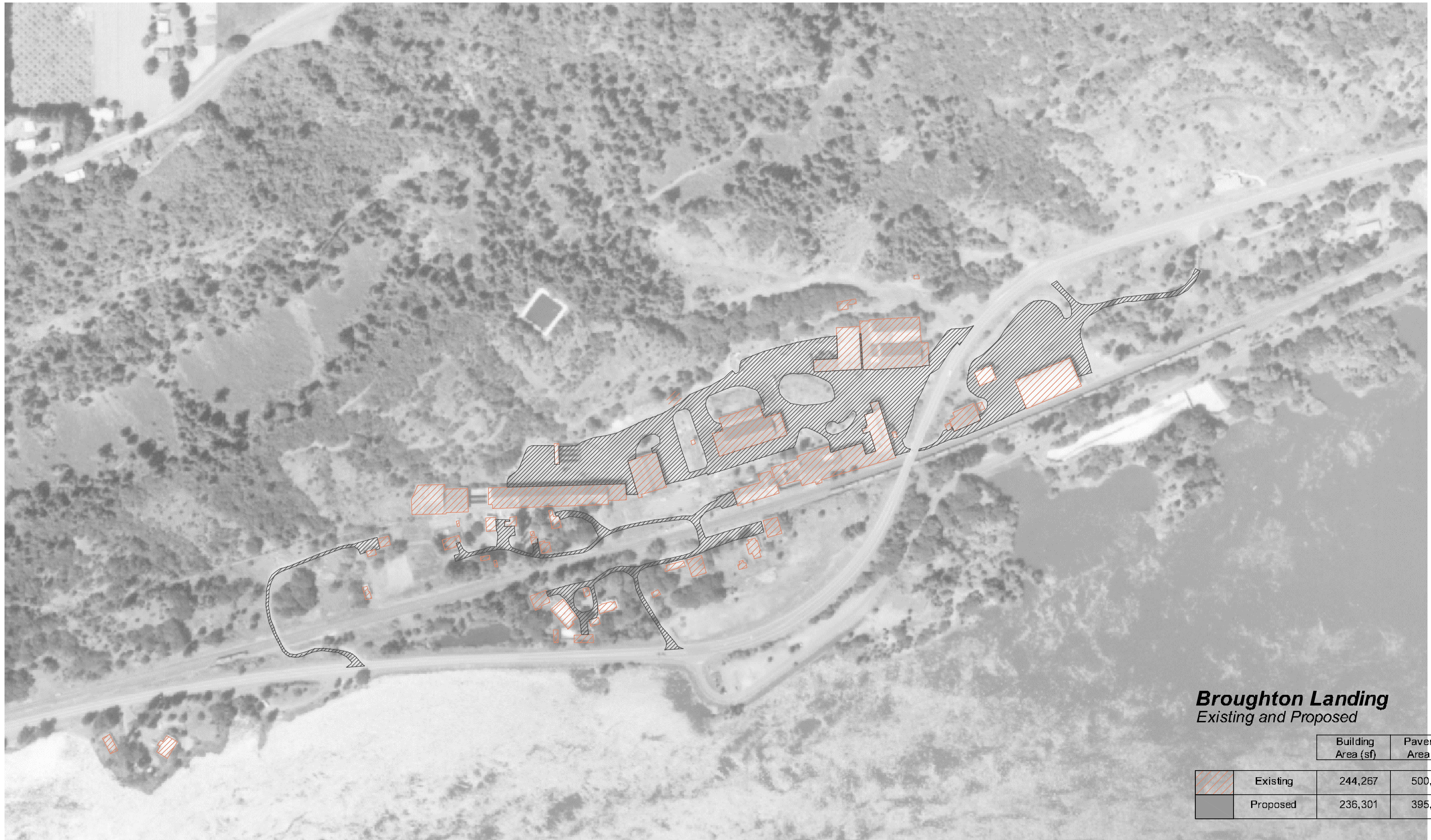
Broughton Landing Existing and Proposed