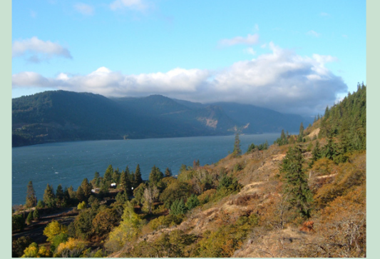
14 miles of new public trails through 300 acres of conservation easements.