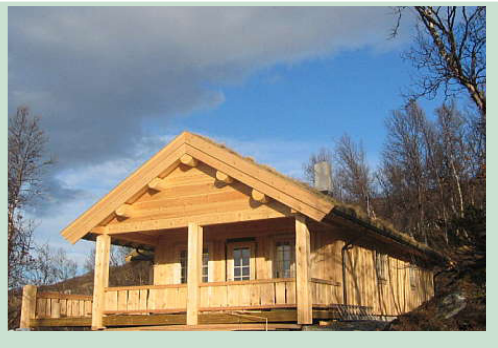
Ecologically appropriate, visually subordinate cabin design.

Town home design inspired by historic mill buildings.