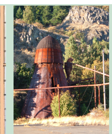
Preserving Broughton's historic & cultural legacy.