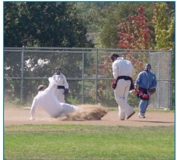
Figure 1: Contractor in protective gear simulates baseball activity

U.S. EPA's concern is further heightened because this preliminary conclusion may not fully account for the higher toxicity of amphibole asbestos, as well as other uncertainties related to short-term, intermittent exposures early in life. Therefore, the actual risk potential may be higher - although current Agency risk assessments cannot specify exactly how much higher.