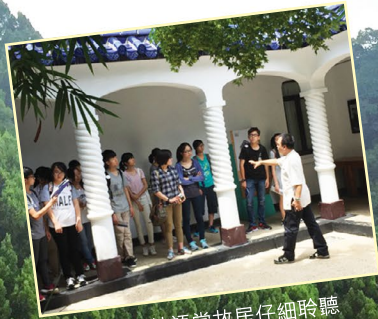
同學在作家林語堂故居仔細聆聽導賞員的講解