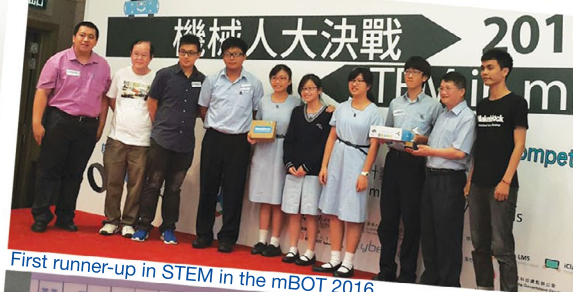
First runner-up in STEM in the mBOT 2016