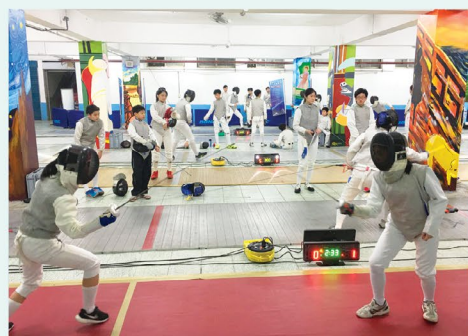
Participants having a friendly exchange of fencing skills with students from Taipei Municipal Cheng Zheng Junior High School.