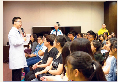
Students are very attentive during a briefing on eye care and eye diseases.