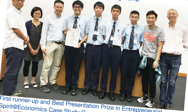
First runner-up and Best Presentation Prize in Entrepreneurial Spirit@Economics Case Study Competition