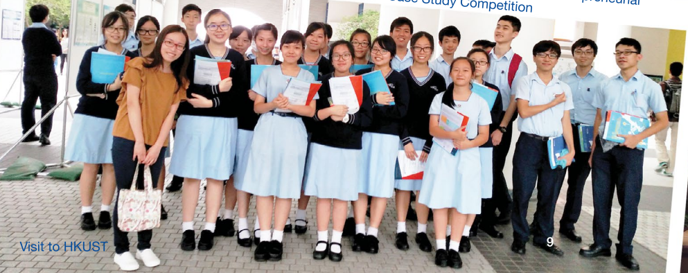
Visit to HKUST