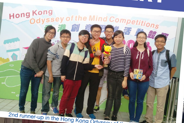
2nd runner-up in the Hong Kong Odyssey of the Mind Competition