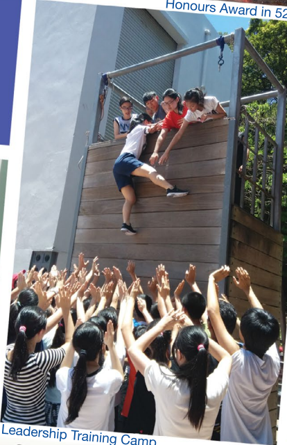
Leadership Training Camp