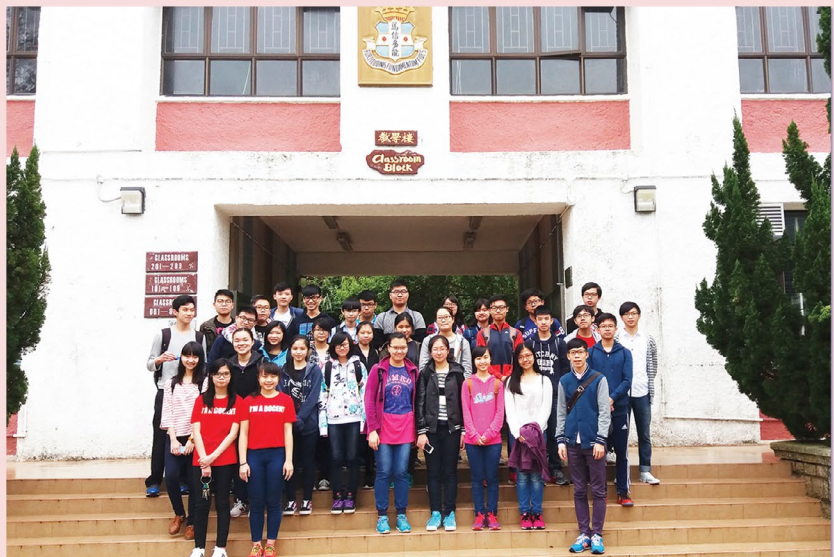
A group of history lovers are ready to explore the valuable historic sites.