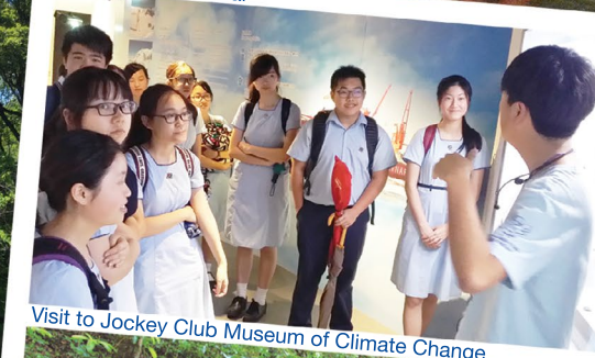
Visit to Jockey Club Museum of Climate Change