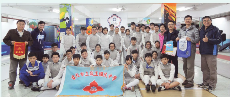
Our students taking a group photo with Taipei Municipal Cheng Zheng Junior High School students as a token of friendship after the match.

Our school's fencing team went on a four-day Taiwan training tour during the Easter holidays. Not only did the 19 fencing team members visit Ming Chun University, Taipei Municipal Cheng Zheng Junior High School and Taipei Municipal Yu Cheng Senior High School, they also played friendly matches with some Taiwanese fencers. All participants found the experience rewarding and enjoyable.