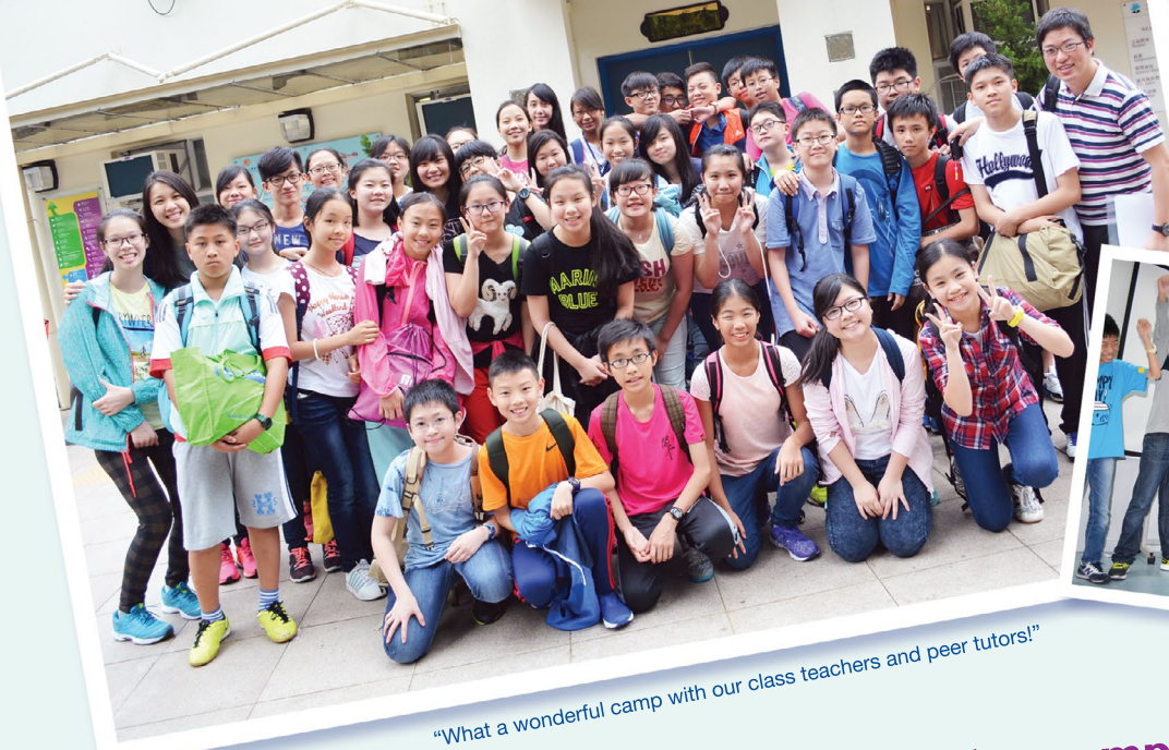
“What a wonderful camp with our class teachers and peer tutors!”