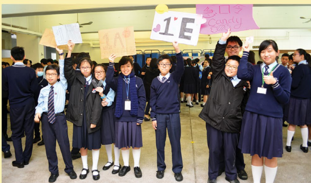
"We are proud to be a Hoipinger."

Furthermore, with the help of peer tutors, S1 students designed and organized their class game stalls relating to emotion – management at lunchtime. The Life Week ended successfully with a fruit sharing session held collaboratively with the Health Education Club. Through these activities, our students had surely learnt some effective strategies in managing their emotions.