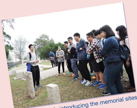
The tour guide is introducing the memorial sites to our students.

On 18th March 2016, 30 History and Chinese History students visited St. Stephen's College Heritage Trail. Highlighting the history of Hong Kong during the Japanese Occupation of the Second World War, the trail was formed by nine historic spots including colonial-style buildings and memorial sites. These cultural relics are valuable assets which provide a legacy not only for the students of St. Stephen's College, but also for all Hong Kong students. The guided tour conducted by three enthusiastic students of St. Stephen's was well-received. The visit to the heritage trail had surely raised our students' awareness of the importance of cultural heritage preservation in Hong Kong.