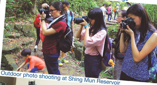
Outdoor photo shooting at Shing Mun Reservoir