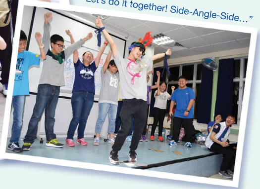
“Are you ready? Let's do it together! Side-Angle-Side...”