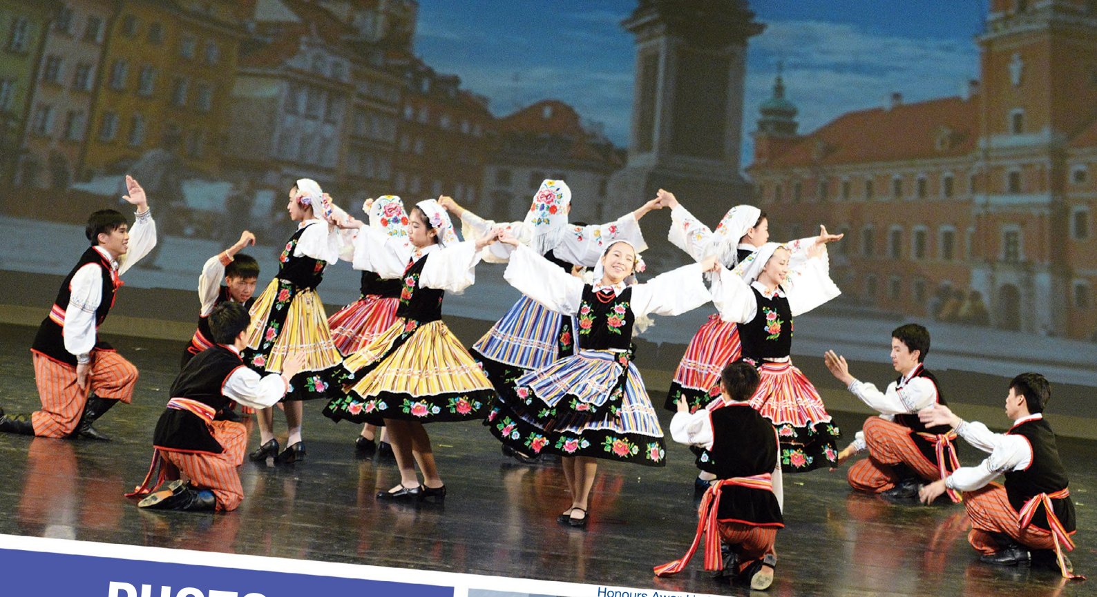
Honours Award in 52nd Schools Dance Festival