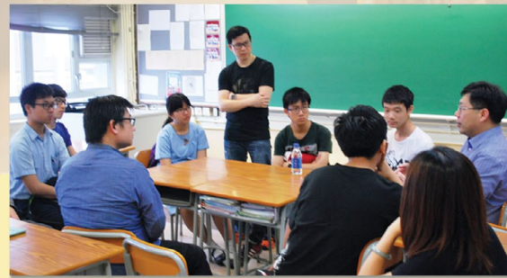
Our alumni are telling the future pillars some 'dos and don'ts'.

After Mr. Yu's inspirational sharing, students attended 2 out of 23 sharing sessions held in different classrooms. 42 alumni and 5 parents were invited to share their life and working experiences with all S4 and S5 students, giving them a clearer picture of the current job market and useful tips for career and life planning. With more exposure to the world of work, it is hoped that students are more aware of the requirements of our society and the importance of developing their abilities and skills for their future.