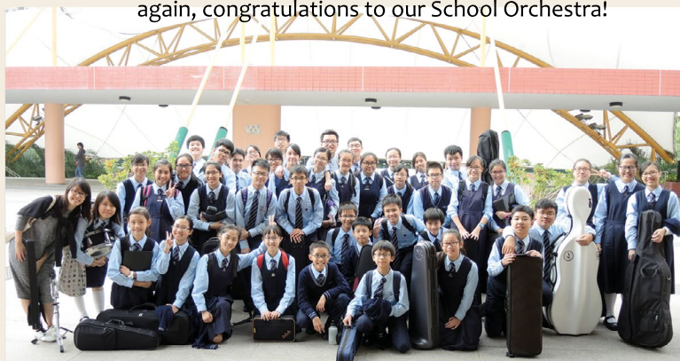
Our young talented musicians are posing confidently before the competition.

On 1st December 2015, our School Orchestra participated in the Hong Kong Youth Music Interflows – Symphony Orchestra Contest 2015 and won the Silver Prize. Hoi Ping students performed the medley of the movie, Harry Potter. The mysterious percussive main theme wove the vivid imagery of film with varied textures. The well balanced orchestration and good cooperativeness of teammates greatly impressed the judges. Once again, congratulations to our School Orchestra!