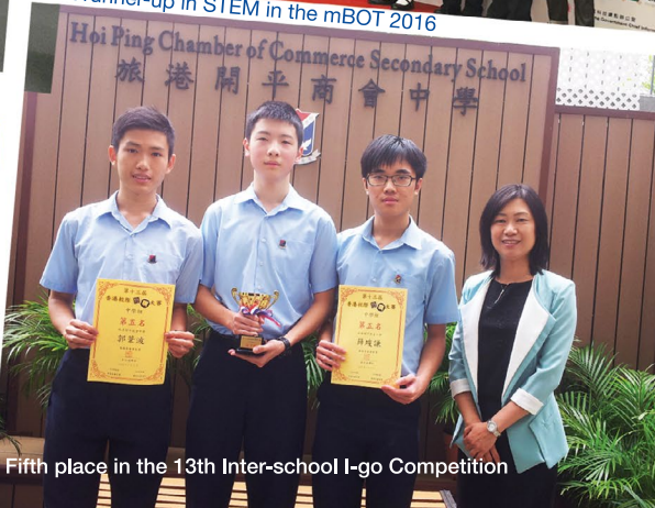
Fifth place in the 13th Inter-school I-go Competition