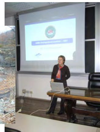
University of Firenze, Department "Ulisse Dini"