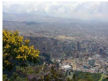
View of Bogotá from Montserrat