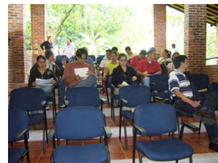
Open air lecture room; waiting for the last students to come

Local support: lodging, food, allowance for personal expenses.