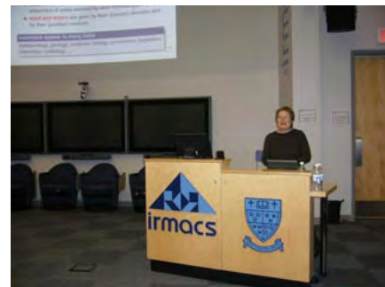
Presenting the talk at the IRMACS Center