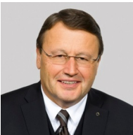
MEP Paul Rübige, EPCF Chair, ITRE, EPP

Paul Rübige, an MEP since 1996, is the longest-serving Austrian MEP. He is Vice-Chair of the Delegation for relations with the Korean Peninsula and member of the ITRE and BUDG Committees. He is also substitute member of the DEVE Committee and the Delegation for relations with the European Economic Area Joint Parliamentary Committee. He spent five years in regional politics and over 20 years in the private sector prior to joining the European Parliament. He is EPCF Chair since 2014 after having been a member since 2010.