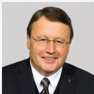
MEP Paul Rübig