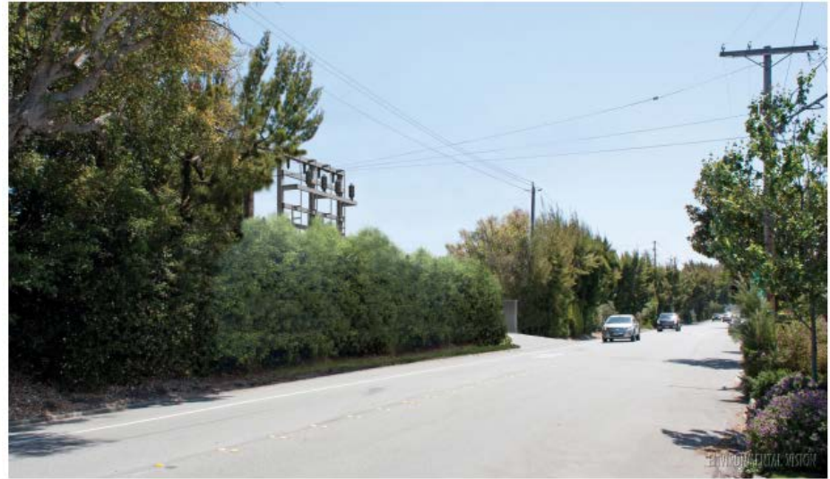
Simulated View of PS-3 at California/Mills