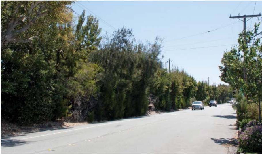
Existing View of New Location for PS-3 at California/Mills