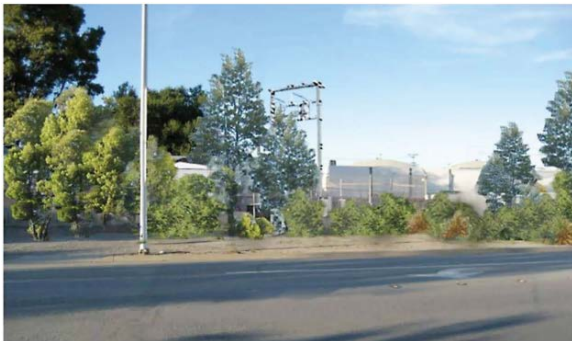
Paralleling Station Rendering at California/Lincoln