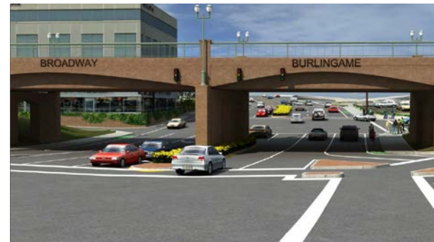
Broadway Grade Separation Rendering