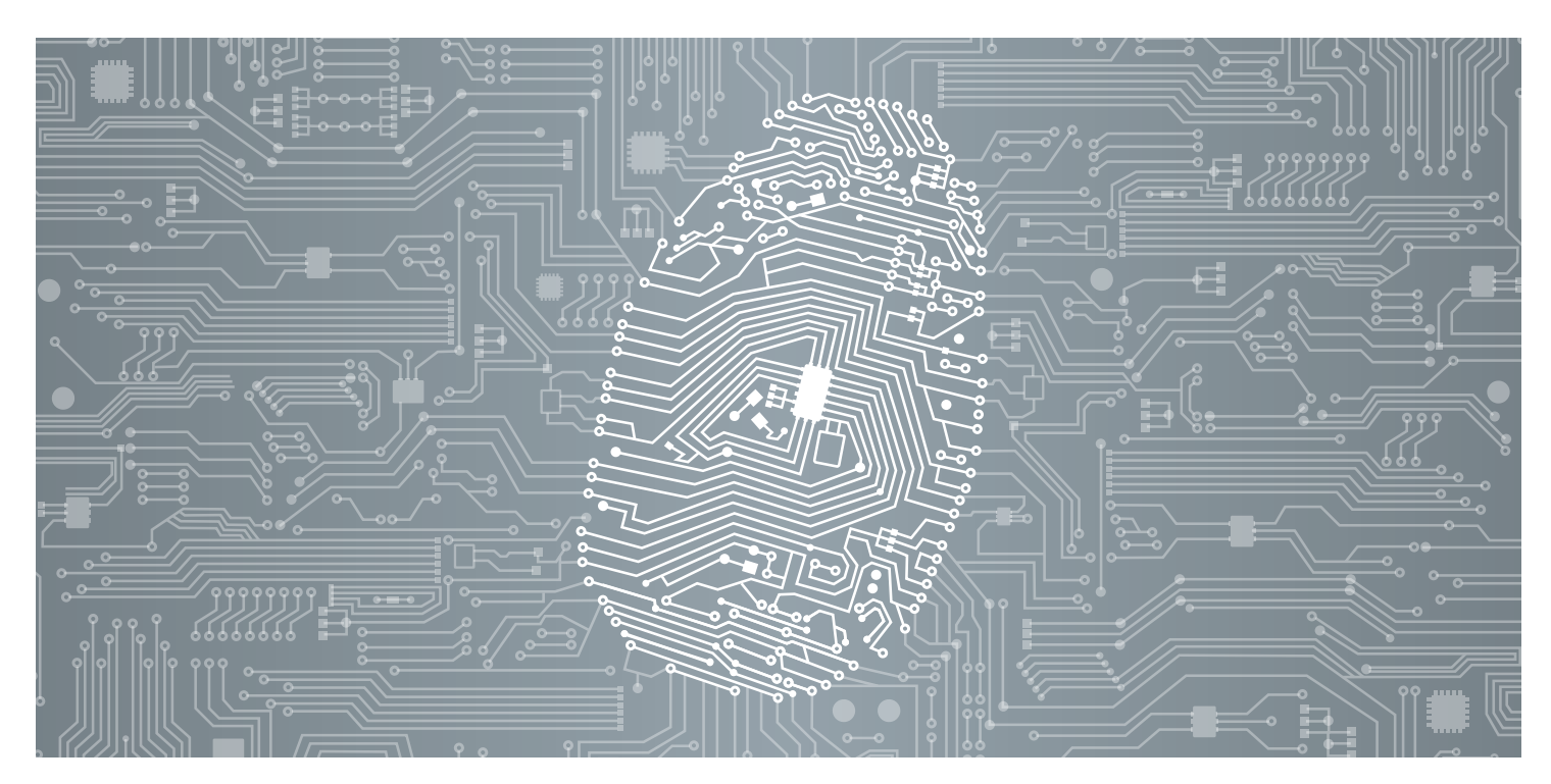
UBS Electronic Trading