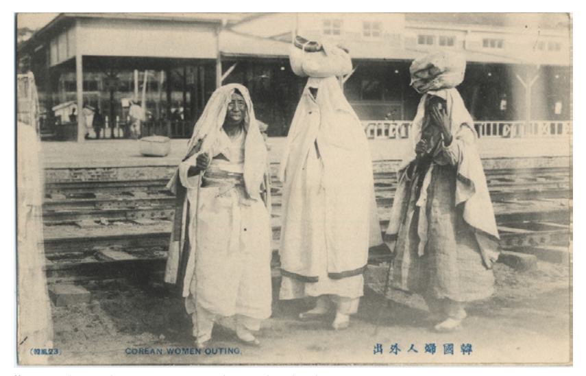
<sup>33</sup> Korean lower-class women wear veils over their heads 1904

North Korean men are not more prone to perpetrating sexual violence than men from other nations and societies. Sexual violence is an enduring crosscultural and cross-border problem. Nevertheless, its prevalence can be higher in societies that govern women through male-dominated and powerful physical and psychological institutions, suggesting that durable historical and patriarchal norms support sexual violence, even if they cannot explain it in its entirety.