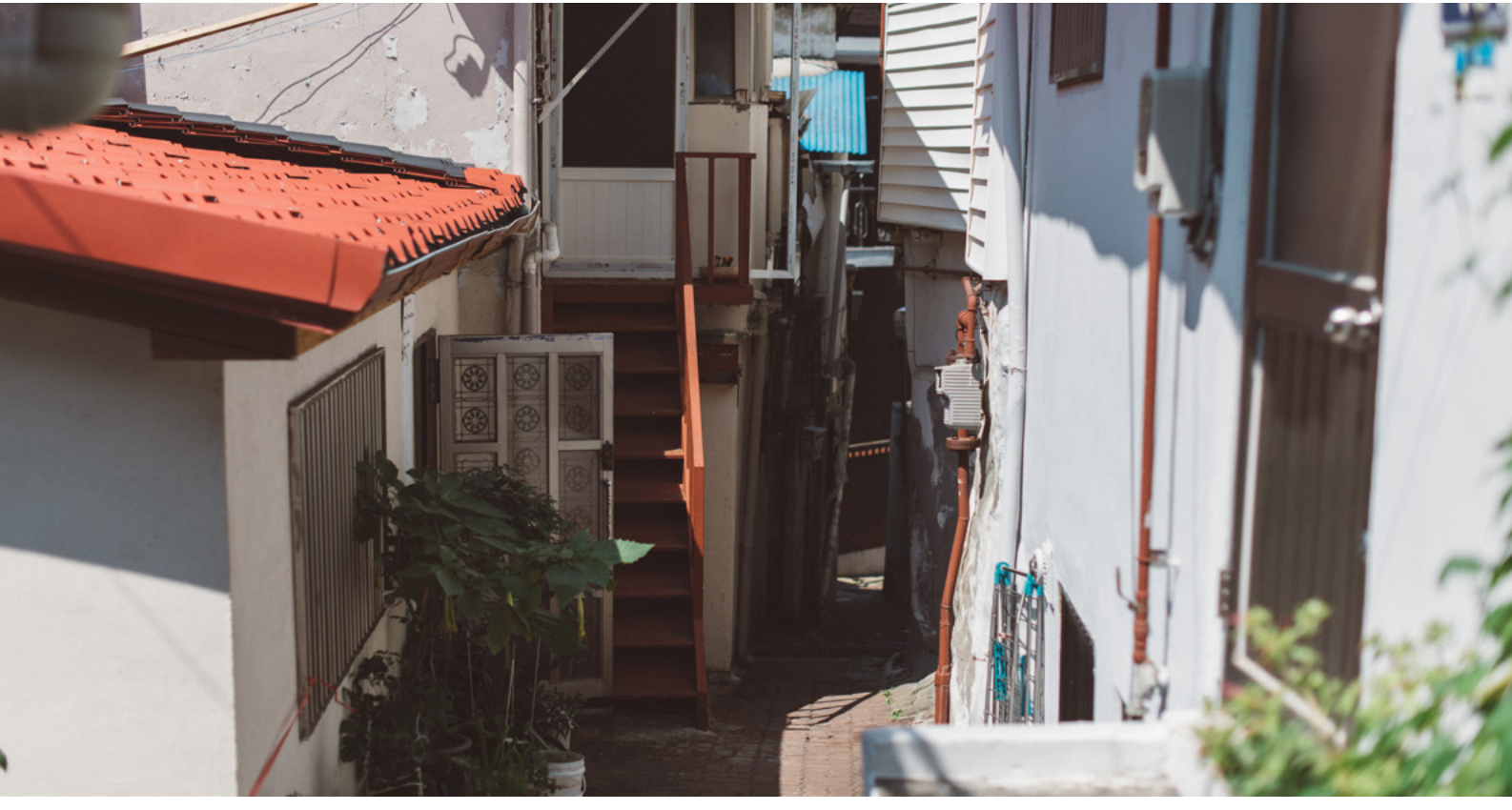
<sup>30</sup> Interviews were conducted at a host of venues, including private homes

The names and identifying details of all interviewees have been withheld to protect their identities and safety. In some cases, potentially identifying details concerning experiences of sexual violence have also been withheld based upon security concerns or personal requests. Details that may put the families or friends of interviewees who are still alive or living in North Korea at risk have not been included in this report. Pseudonyms are used in all cases with the aforementioned concerns and requests in mind.