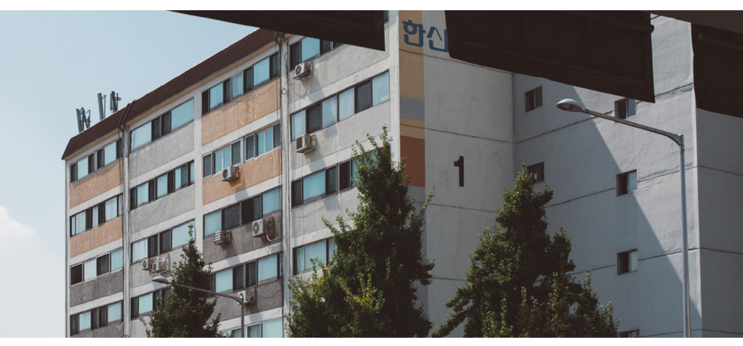
<sup>106</sup> Many interviewees in South Korea reported feelings of isolation and dissociation from wider society

Just as victims experience sexual violence in different forms, survivors encounter its physical, psychological, and behavioural consequences in diverse ways. Sexual violence had undeniably damaged the physical and psychological health of many interviewees, increased their risk of further health problems, degraded their self-worth, and impacted their social behaviours. These consequences accompanied their journeys to freedom in South Korea and Europe and remain to this day.