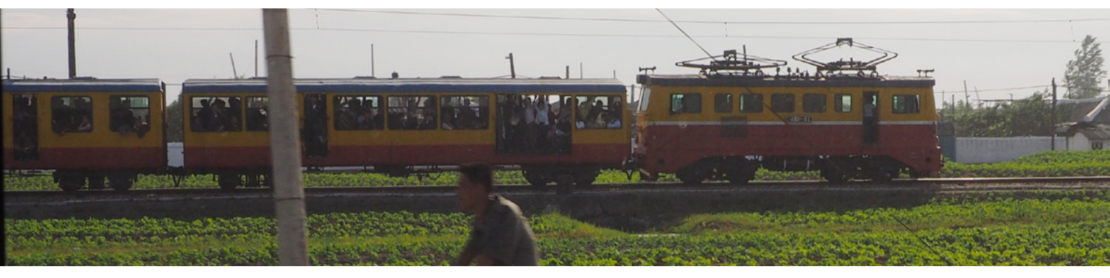
<sup>72</sup> A train travels in Hamhung, North Korea's second largest city

Beside poorly-funded detention facilities for homeless children, known as guhoso , that are scattered throughout major towns and cities, kotjebi receive little care from the government.<sup>70</sup> Interviewees who were accustomed with guhoso claimed that kotjebi were forced into uncompensated labour and provided limited food rations. After these experiences, many would escape back to the streets.<sup>71</sup> Kotjebi who resist or evade institutionalisation are at risk of arrest and deportation back to their home provinces.