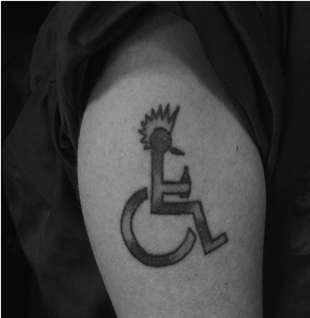
Figure 5. Disability, identity, the body, subculture: a disabled punk's tattoo.

sexuality (and not simply heterosexuality) that told stories ranging from tongue-tied fancying to tongue-twisting sexual acts. The socialist writer David Widgery, who was himself a polio survivor, has explained: 'That's why I found Ian Dury so emancipated. Suddenly there was this sex symbol who had a limp' (quoted in Gould 1995, p. 250). On the other hand, a problem with Dury as a cultural representative of disabled people may have been his dirty old man in a mac persona – that in a way he confirmed for what he called the 'walkie-talkies', the inhabitants of 'normal-land', and what other disability activists have called the TABs (temporarily able bodied), something distasteful, dangerous, deviant, sexually threatening within, even inherent to, people with disabilities.