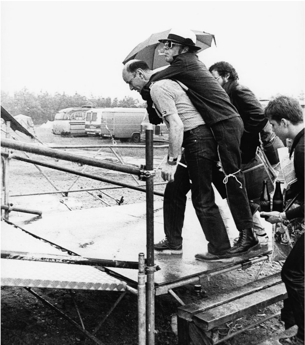
Figure 4. Ian Dury being lifted on stage at a festival, Denmark, early 1980s.