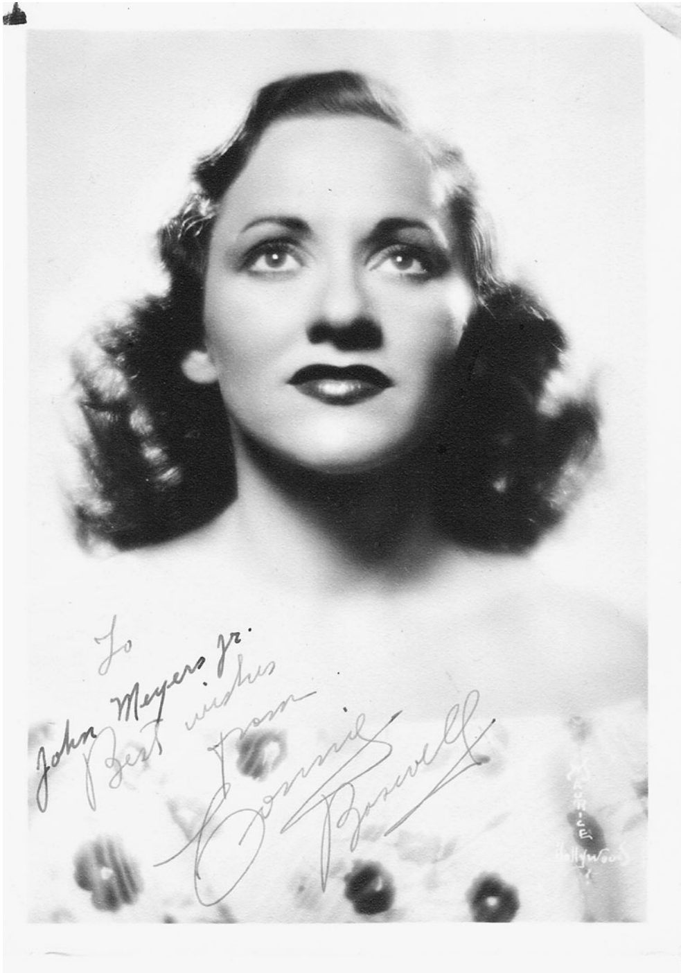
Figure 1. Connie Boswell publicity card, 1938/1944.

the seventy years in which polio epidemics were widespread, the various electronic media – cinema, radio, television – were also coming into their own'; Shell 2005, p. 1.)