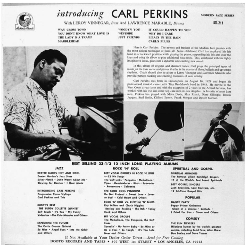
Figure 3. Back cover of 1956 LP, Introducing ... Carl Perkins .

time think it's out of tune, but it would be more accurate to say he plays in an alternative tuning. (Palmer 2004)