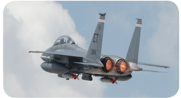
An F-15E conducts a vibration fly-around test.