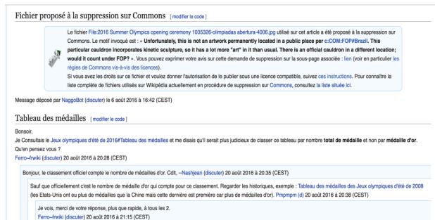
Figure 2: The FR talk page for the 2016 Summer Olympic article includes special boxes to organize the threaded discussion

Across all the languages, one of the most common posting type was Other (see Table 7). To better understand this observation,